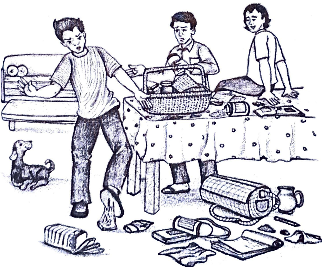
George trod on the butter.