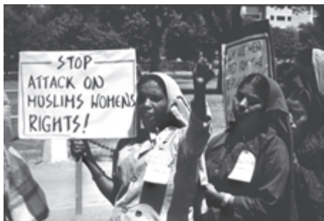
Muslim women are an important part of the women's movement in India.

not all – Muslims may wear a burqa , sport a long beard, wear a fez , and these become ways to identify all Muslims. Because of this, they tend to be identified differently and some people think they are not like the ‘rest of us’. Often this becomes an excuse to treat them unfairly, and discriminate against them. Do you remember reading in your Class VII book about how the Ansaris were finding it difficult to rent a house? This social marginalisation of Muslims in some instances has led to them migrating from places where they have lived, often leading to the ghettoisation of the community. Sometimes, this prejudice leads to hatred and violence.