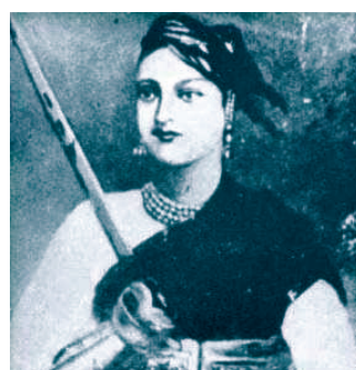
Jhansi Rani Laxmi Bai

this incident angered the British and General Henry Havelock, who was sent to deal with the situation, defeated Nana Sahib the day after the massacre. Neill, who was left there, took terrible vengeance and those whom he regarded as guilty were executed. Towards the close of November Tantia Topi seized Kanpur but it was soon recovered by Campbell.