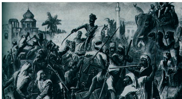
1857 Great Rebellion