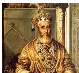
Bahadur Shah II

By June the revolt had spread to Rohilkhand, where the whole countryside was in rebellion. Khan Bahadur Khan proclaimed himself the viceroy of the Emperor of India. Nearly all of Bundelkhand and the entire Doab region were up in arms against the British. At Jhansi, Europeans were massacred and Laxmi Bai, aged 22, was enthroned. In Kanpur Nana Sahib led the rebels. About 125 English women and their children along with English officers were killed and their bodies were thrown into a well. Termed as the Kanpur massacre,