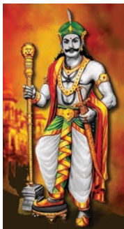
Veera Pandiya Kattabomman