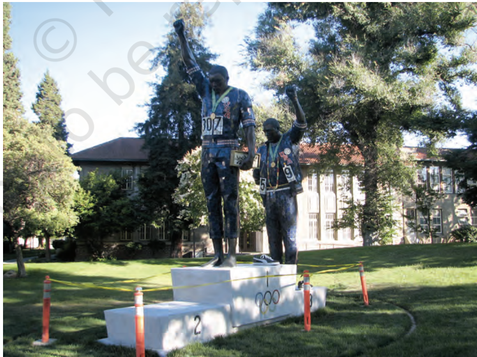
In 2005, the San Jose State University installed a 20-foot high sculpture representing the protest by Tommie Smith and John Carlos. A photograph of the original medal ceremony in 1968 is on the top.

Do you think that Carlos and Smith should have raised an internal matter of American society in an international forum? Would you say that what they did was political? Why do you think Peter Norman, who was neither Black nor American, joined in the gesture of protest? If you were in Norman's place what would you do?