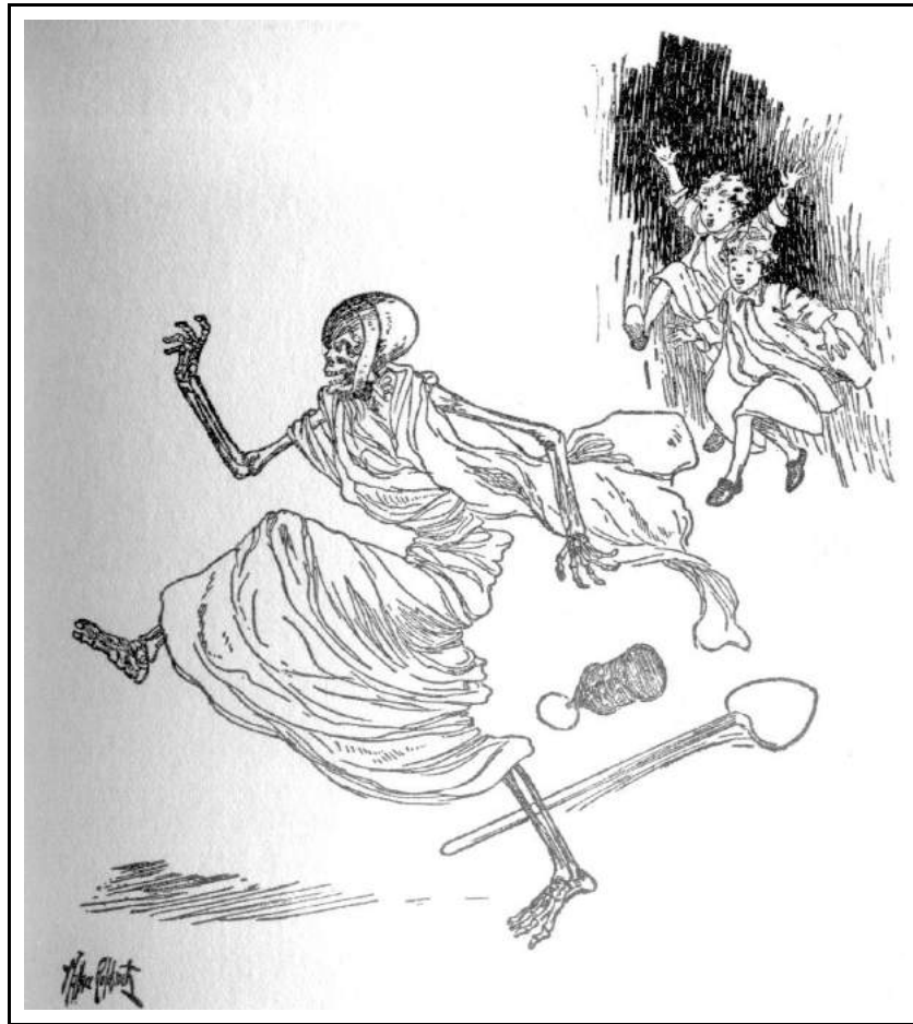
"SUDDENLY THERE LEAPED OUT TWO FIGURES."

two figures, who waved their arms wildly above their heads, and shrieked out "BOO!" in his ear.