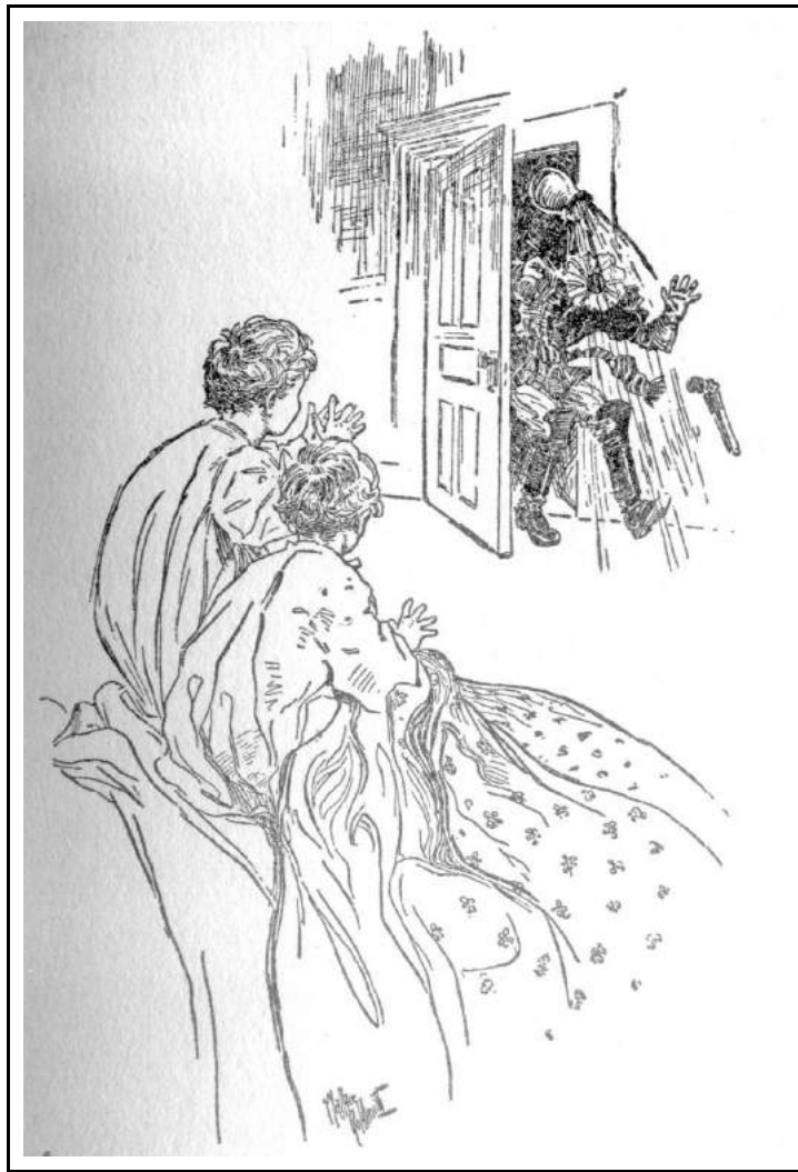
"A HEAVY JUG OF WATER FELL RIGHT DOWN ON HIM."