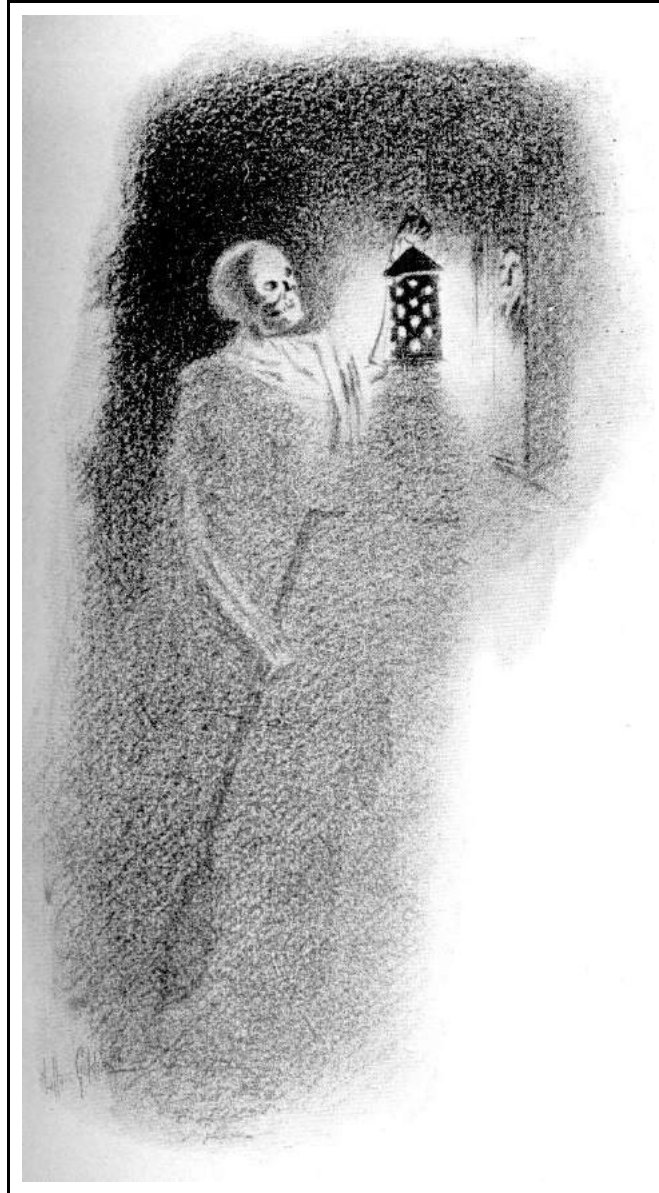
"MAKING SATIRICAL REMARKS ON THE PHOTOGRAPHS"

that at all consoled him in the whole affair was the fact that he had not brought his head with him, for, had he done so, the consequences might have been very serious.