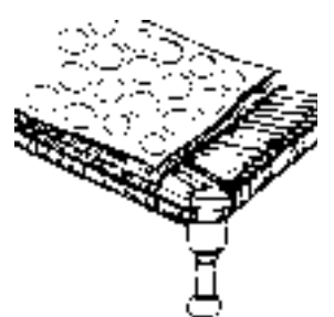
Fig. 9.1: Dehydration

chips, badis , etc., by sun-drying at home. Vegetables can also be sundried by first blanching and then drying. You can sundry beans, peas, potatoes, cauliflower, ladies finger, garlic, onion and all leafy vegetables. Fruits like apricots, bananas, dates, grapes, peaches, pears, apples, etc. can also be sun-dried. The process is simple.