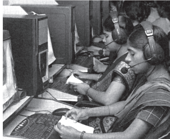
A Call Centre

Nike grew enormously from its inception in the 1960s. Nike grew as an importer of shoes. The founder Phil Knight imported shoes from Japan and sold them at athletics meetings. The company grew to a multinational enterprise, a transnational corporation. Its headquarters are in Beaverton, just outside Portland, Oregon. Only two US factories ever made shoes for Nike. In the 1960s they were made in Japan. As costs increased production shifted to South Korea in mid-1970s. Labour costs grew in South Korea, so in the 1980s production widened to Thailand and Indonesia. Since the 1990s we in India produce Nike. However, if labour is cheaper elsewhere production centres will move somewhere else. This entire process makes the labouring population very vulnerable and insecure. This flexibility of labour often works in favour of the producers. Instead of mass production of goods at a centralised location (Fordism), we have moved to a system of flexible production at dispersed locations (post-Fordism).