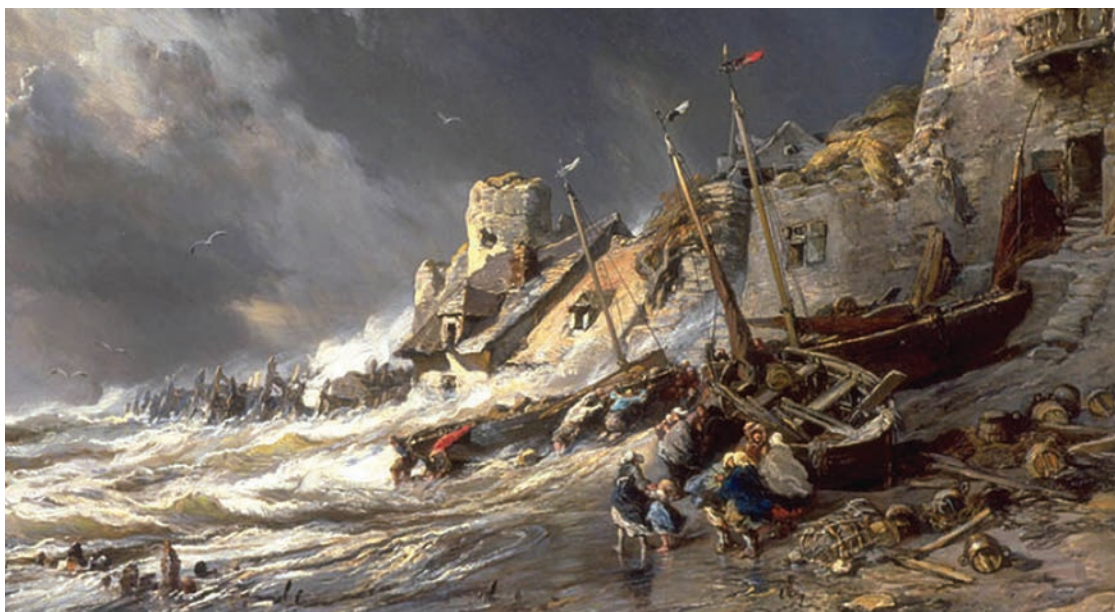
Figure 1.1: Coast Scene

Technology refers to methods, systems and devices, which are a result of scientific knowledge, being used for practical purposes. For example, Muskan went to an excursion to Bhubaneswar and visited the State Museum. She saw various mineral ores in the mineral section of the museum. She decided to capture photographs to share with others who may not have seen the ores. She borrowed her teacher's mobile and clicked pictures of the rare collection. She shared all the pictures on her blog along with a description of the ores. Many viewers commented and appreciated Muskan for sharing those pictures and description.