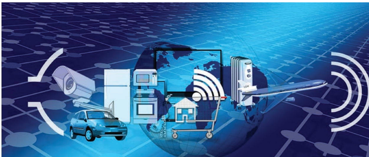
Figure 1.2: ICT Around Us

digital television. In addition to printed newspapers now we also have their electronic versions. Along with traditional radio, we also have online radio.