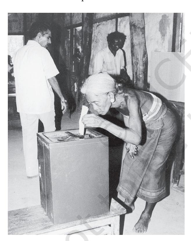
An old lady voting in election

Modern society, with its size and complexity, offers few opportunities for direct democracy. Today, the most common form of democracy, whether for a town of 50,000 or nations of 1 billion, is representative democracy, in which citizens elect officials to make political decisions, formulate laws, and administer programmes for the public good. Ours is a representative democracy. Every citizen has the important right to vote her/his representative. People elect their representatives to all levels from Panchayats, Municipal Boards, State Assemblies