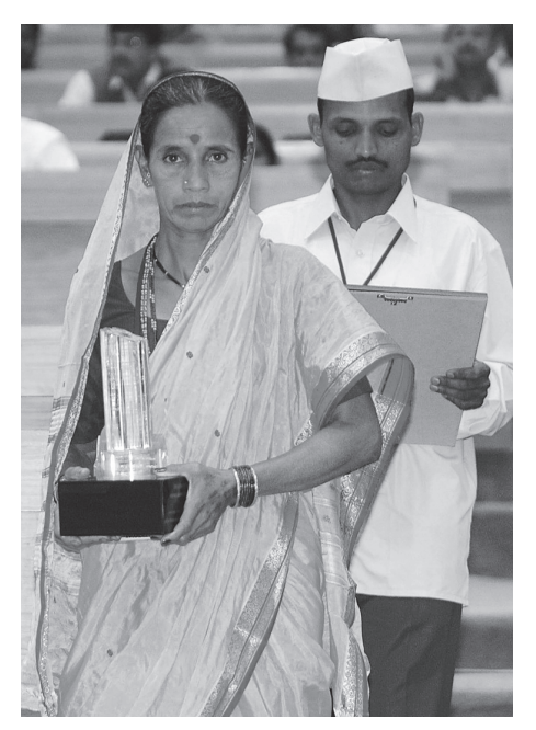
A woman Panch with her reward

importantly, control of local resources is given to the elected local bodies.