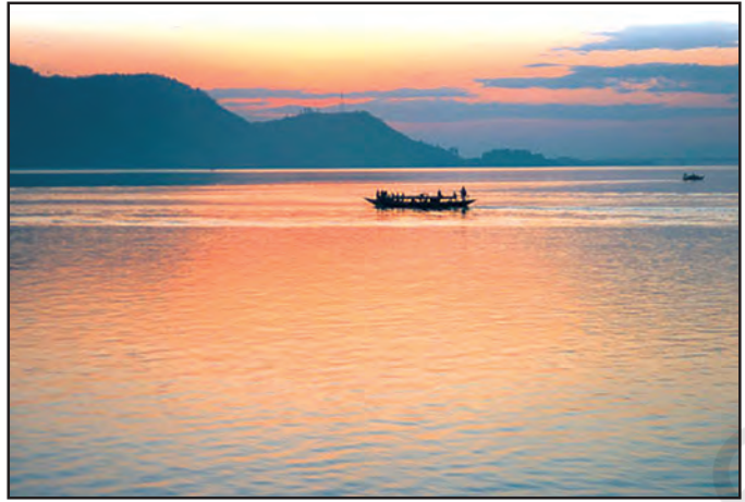
Fig. 8.7 Brahmaputra river

The tributaries of rivers Ganga and Brahmaputra together form the Ganga-Brahmaputra basin in the Indian subcontinent (Fig. 8.8). The basin lies in the sub-tropical region that is situated between 10°N to 30°N latitudes. The tributaries of the River Ganga like the Ghaghra, the Son, the Chambal, the Gandak, the Kosi and the tributaries of Brahmaputra drain it. Look at the atlas and find names of some tributaries of the River Brahmaputra.