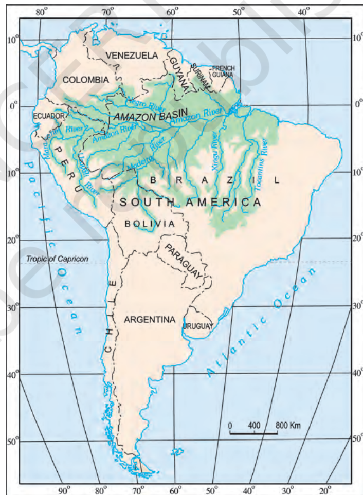
Fig. 8.2: The Amazon Basin in South America

Name the countries of the basin through which the equator passes.