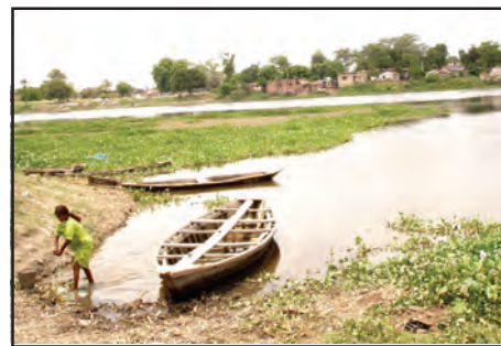
A Polluted Lake

to sell in the market. They have even begun supply to the neighbouring town. The community is living in harmony with nature. As long as the pollutants from nearby towns do not find their way into the lake waters, the fish cultivation will not face any threat.