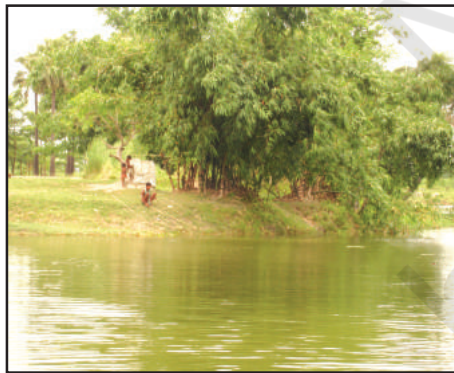
A clean lake

Binod is a fisherman living in the Matwali Maun village of Bihar. He is a happy man today. With the efforts of the fellow fishermen – Ravindar, Kishore, Rajiv and others, he cleaned the maun or the ox-bow lake to cultivate different varieties of fish. The local weed (vallisneria, hydrilla) that grows in the lake is the food of the fish. The land around the lake is fertile. He sows crops such as paddy, maize and pulses in these fields. The buffalo is used to plough the land. The community is satisfied. There is enough fish catch from the river – enough fish to eat and enough fish