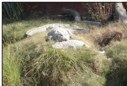
Fig. 8.12 : Crocodiles