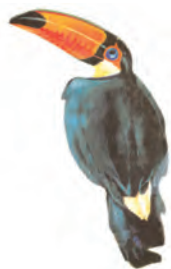
Fig. 8.4 : Toucans

The rainforest is rich in fauna. Birds such as toucans (Fig. 8.4), humming birds, macaw with their brilliantly coloured plumage, oversized bills for eating make them different from birds we commonly see in India. These birds also make loud sounds in the forests. Animals like monkeys, sloth and ant-eating tapirs are found here (Fig. 8.5). Various species of reptiles and snakes also thrive in these jungles. Crocodiles, snakes, pythons abound. Anaconda and boa constrictor are some of the species. Besides, the basin is home to thousands of species of insects. Several species of fishes including the flesh-eating Piranha fish is also found in the river. This basin is thus extraordinarily rich in the variety of life found there.