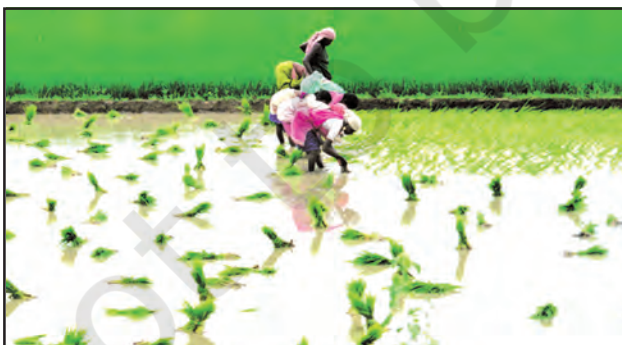
Fig. 8.9 : Paddy Cultivation

The vegetation cover of the area varies according to the type of landforms. In the Ganga and Brahmaputra plain tropical deciduous trees grow, along with teak, sal and peepal. Thick bamboo groves are common in the Brahmaputra plain. The delta area is covered with the