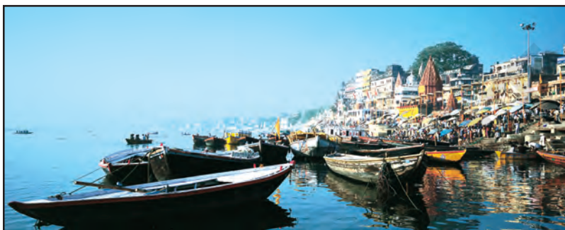
Fig. 8.13: Varanasi along the River Ganga

The Ganga-Brahmaputra plain has several big towns and cities. The cities of Allahabad, Kanpur, Varanasi, Lucknow, Patna and Kolkata all with the population of more than ten lakhs are located along the River Ganga (Fig. 8.13). The wastewater from these towns