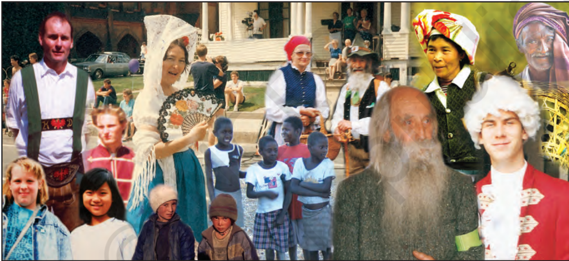
Fig. 8.1: People from various parts of the world