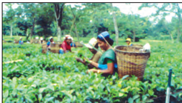
Fig. 8.10 : Tea Garden in Assam