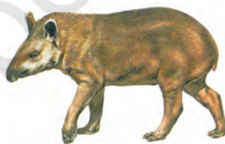
Fig. 8.5 : Tapir

The rainforest is rich in fauna. Birds such as toucans (Fig. 8.4), humming birds, macaw with their brilliantly coloured plumage, oversized bills for eating make them different from birds we commonly see in India. These birds also make loud sounds in the forests. Animals like monkeys, sloth and ant-eating tapirs are found here (Fig. 8.5). Various species of reptiles and snakes also thrive in these jungles. Crocodiles, snakes, pythons abound. Anaconda and boa constrictor are some of the species. Besides, the basin is home to thousands of species of insects. Several species of fishes including the flesh-eating Piranha fish is also found in the river. This basin is thus extraordinarily rich in the variety of life found there.