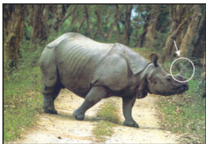
Fig. 8.11 : One horned rhinoceros

There is a variety of wildlife in the basin. Elephants, tigers, deer and monkeys are common. The one-horned rhinoceros is found in the Brahmaputra plain. In the delta area, Bengal tiger and crocodiles are found. Aquatic life abounds in the fresh river waters, the lakes and the Bay of Bengal Sea. The most popular varieties of the fish are the rohu, catla and hilsa. Fish and rice is the staple diet of the people living in the area.