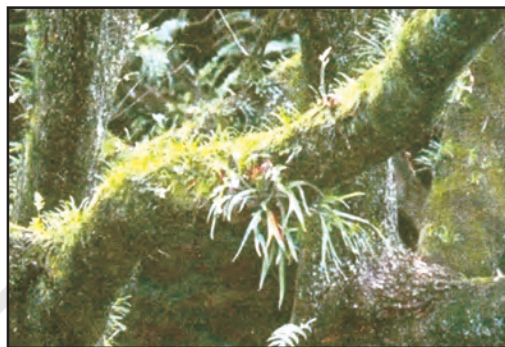
Fig. 8.3 : The Amazon Forest

As it rains heavily in this region, thick forests grow (Fig. 8.3). The forests are in fact so thick that the dense “roof” created by leaves and branches does not allow the sunlight to reach the ground. The ground remains dark and damp. Only shade tolerant vegetation may grow here. Orchids, bromeliads grow as plant parasites.