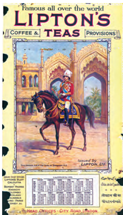
Fig. 2 – Advertisements help create taste

Consider an example. In the histories written by British historians in India, the rule of each Governor-General was important. These histories began with the rule of the first Governor-General, Warren Hastings, and ended with the last Viceroy, Lord Mountbatten. In separate chapters we read about the deeds of others –