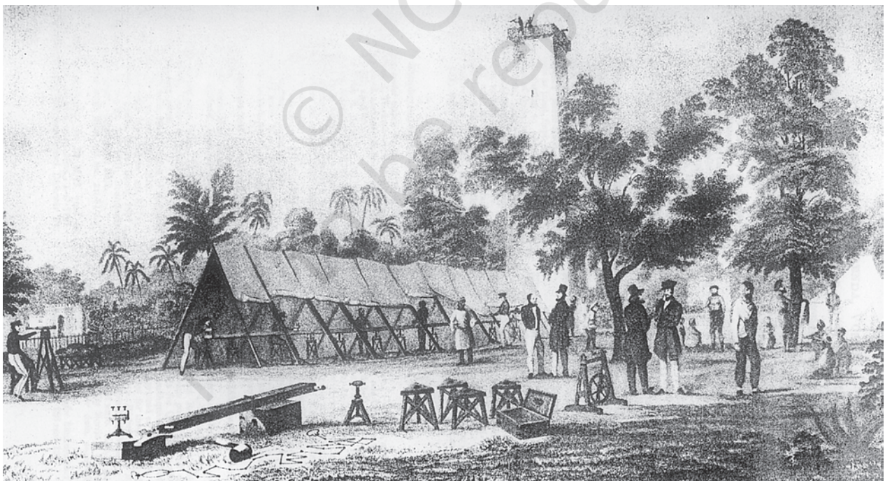
Fig. 6 – Mapping and survey operations in progress in Bengal, a drawing by James Prinsep, 1832

From this vast corpus of records we can get to know a lot, but we must remember that these are official records. They tell us what the officials thought, what