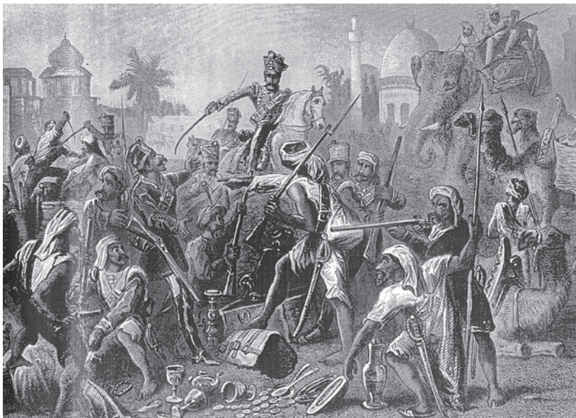
Fig. 7 – The rebels of 1857

Images need to be carefully studied for they project the viewpoint of those who create them. This image can be found in several illustrated books produced by the British after the 1857 rebellion. The caption at the bottom says: “Mutinous sepoys share the loot”. In British representations the rebels appear as greedy, vicious and brutal. You will read about the rebellion in Chapter 5.