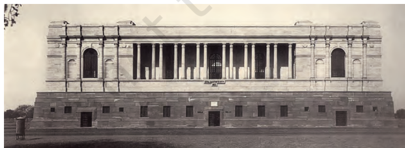
Fig. 4 – The National Archives of India came up in the 1920s

In the early years of the nineteenth century these documents were carefully copied out and beautifully written by calligraphists – that is, by those who specialised in the art of beautiful writing. By the middle of the nineteenth century, with the spread of printing, multiple copies of these records were printed as proceedings of each government department.