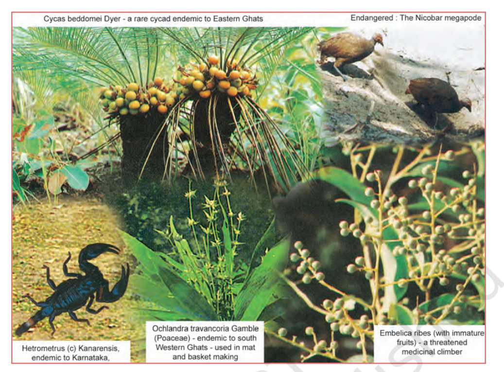
Fig. 2.2: A few extinct, rare and endangered species

a resource obtaining directly and indirectly from the forests and wildlife - wood, barks, leaves, rubber, medicines, dyes, food, fuel, fodder, manure, etc. So it is we ourselves who have depleted our forests and wildlife. The greatest damage inflicted on Indian forests was during the colonial period due to the expansion of the railways, agriculture, commercial and scientific forestry and mining activities. Even after Independence, agricultural expansion continues to be one of the major causes of depletion of forest resources. Between 1951 and 1980, according to the Forest Survey of India, over 26,200 sq. km. of forest area was converted into agricultural land all over India. Substantial parts of the tribal belts, especially in the northeastern and central India, have been deforested or degraded by shifting cultivation (jhum), a type of 'slash and burn' agriculture.