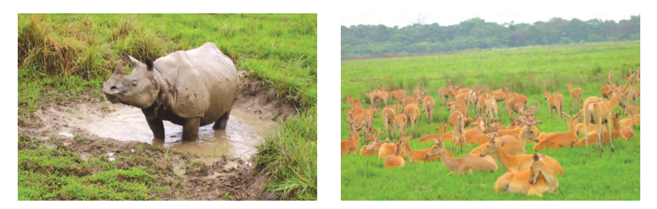
Fig. 2.4: Rhino and deer in Kaziranga National Park

dwindled to 1,827 from an estimated 55,000 at the turn of the century. The major threats to tiger population are numerous, such as poaching for trade, shrinking habitat, depletion of prey base species, growing human population, etc. The trade of tiger skins and the use of their bones in traditional medicines, especially in the Asian countries left the tiger population on the verge of extinction. Since India and Nepal provide habitat to about two-thirds of the surviving tiger population in the world, these two nations became prime targets for poaching and illegal trading.