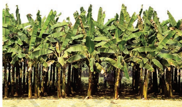
Fig. 4.2: Banana plantation in Southern part of India

In India, tea, coffee, rubber, sugarcane, banana, etc., are important plantation crops. Tea in Assam and North Bengal coffee in