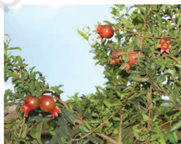
Fig. 4.12: Apricots, apple and pomegranate

Horticulture Crops: In 2014 India was the second largest producer of fruits and vegetables in the world after China. India is a producer of