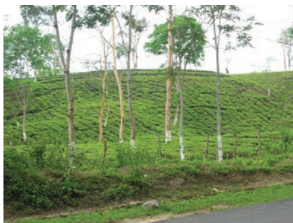
Fig. 4.10: Tea Cultivation

Coffee: In 2014 India produced 3.5 per cent of the world coffee production. Indian coffee is known in the world for its good quality. The Arabica variety initially brought from Yemen is produced in the country. This variety is in great demand all over the world. Initially its cultivation was introduced on the Baba Budan Hills and even today its cultivation is confined to the Nilgiri in Karnataka, Kerala and Tamil Nadu.