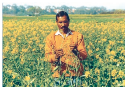
Fig. 4.9: Groundnut, sunflower and mustard are ready to be harvested in the field