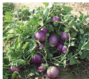
Fig. 4.13: Cultivation of vegetables – peas, cauliflower, tomato and brinjal