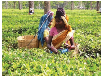
Fig. 4.11: Tea-leaves Harvesting

tropical as well as temperate fruits. Mangoes of Maharashtra, Andhra Pradesh, Telangana, Uttar Pradesh and West Bengal, oranges of Nagpur and Cherrapunjee (Meghalaya), bananas of Kerala, Mizoram, Maharashtra and Tamil Nadu, lichi and guava of Uttar Pradesh and Bihar, pineapples of Meghalaya, grapes of Andhra Pradesh, Telangana and Maharashtra, apples, pears, apricots and walnuts of Jammu and Kashmir and Himachal Pradesh are in great demand the world over.