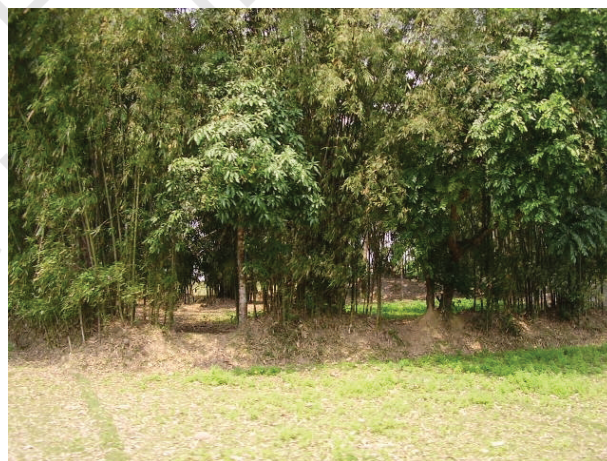
Fig. 4.3: Bamboo plantation in North-east

Karnataka are some of the important plantation crops grown in these states. Since the production is mainly for market, a well-developed network of transport and communication connecting the plantation areas, processing industries and markets plays an important role in the development of plantations.