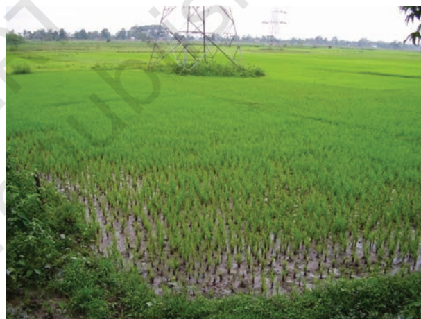
Fig. 4.4 (a): Rice Cultivation

Rice is grown in the plains of north and north-eastern India, coastal areas and the deltaic regions. Development of dense network