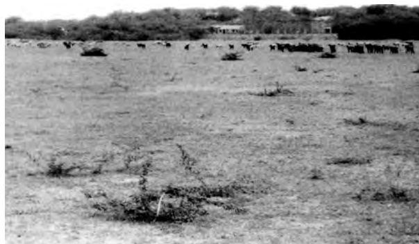
Figure 6.4 : Arid Soil

Arid soils range from red to brown in colour. They are generally sandy in structure and saline in nature. In some areas, the salt content is so high that common salt is obtained by evaporating the saline water. Due to the dry climate, high temperature and accelerated evaporation, they lack moisture and humus. Nitrogen is insufficient and the phosphate