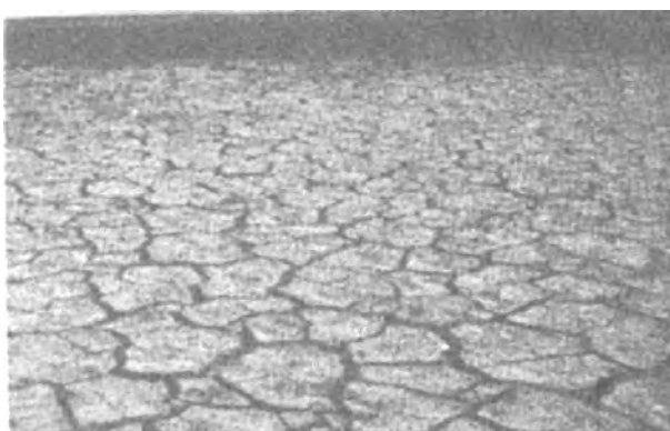
Figure 6.3 : Black Soil During Dry Season

western part of the Deccan Plateau, the black soil is very deep. These soils are also known as the 'Regur Soil' or the 'Black Cotton Soil'. The black soils are generally clayey, deep and impermeable. They swell and become sticky when wet and shrink when dried. So, during the dry season, these soil develop wide cracks. Thus, there occurs a kind of ' self ploughing '. Because of this character of slow absorption and loss of moisture, the black soil retains the moisture for a very long time, which helps the crops, especially, the rain fed ones, to sustain even during the dry season.