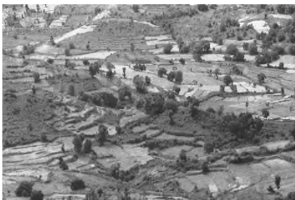
Figure 6.6 : Terrace Farming

for cultivation. If at all the land is to be used for agriculture, terraces should carefully be made. Over-grazing and shifting cultivation in many parts of India have affected the natural cover of land and given rise to extensive erosion. It should be regulated and controlled by educating villagers about the consequences. Contour bunding, Contour terracing, regulated forestry, controlled grazing, cover cropping, mixed farming and crop rotation are some of the remedial measures which are often adopted to reduce soil erosion.