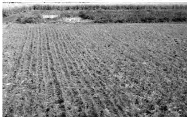
Figure 6.1 : Alluvial Soil

about 40 per cent of the total area of the country. They are depositional soils, transported and deposited by rivers and streams. Through a narrow corridor in Rajasthan, they extend into the plains of Gujarat. In the Peninsular region, they are found in deltas of the east coast and in the river valleys.