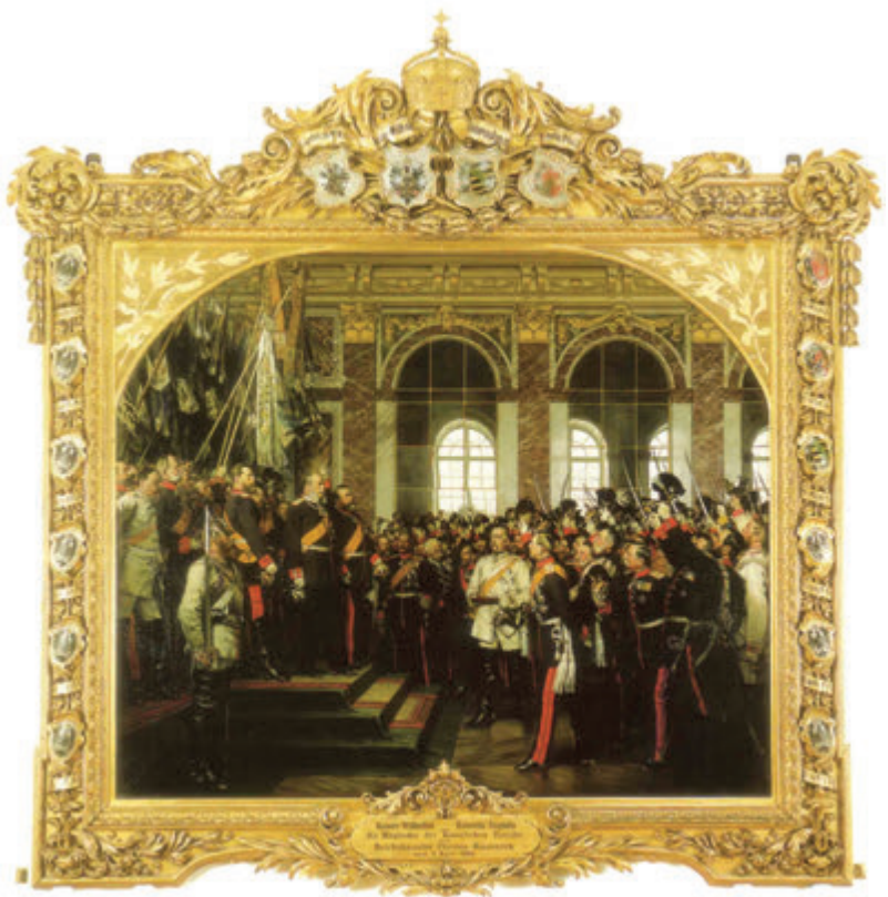
Fig. 11 – The proclamation of the German empire in the Hall of Mirrors at Versailles, Anton von Werner. At the centre stands the Kaiser and the chief commander of the Prussian army, General von Roon. Near them is Bismarck. This monumental work (2.7m x 2.7m) was completed and presented by the artist to Bismarck on the latter's 70th birthday in 1885.

The nation-building process in Germany had demonstrated the dominance of Prussian state power. The new state placed a strong emphasis on modernising the currency, banking, legal and judicial systems in Germany. Prussian measures and practices often became a model for the rest of Germany.