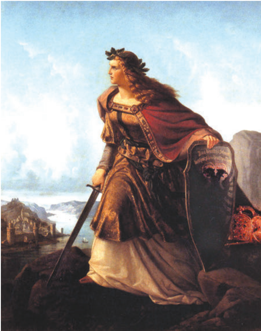
Fig. 19 — Germania guarding the Rhine. In 1860, the artist Lorenz Clasen was commissioned to paint this image. The inscription on Germania's sword reads: 'The German sword protects the German Rhine.'