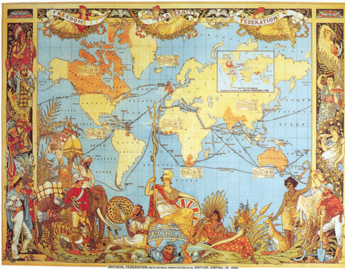
Fig. 20 — A map celebrating the British Empire.

At the top, angels are shown carrying the banner of freedom. In the foreground, Britannia — the symbol of the British nation — is triumphantly sitting over the globe. The colonies are represented through images of tigers, elephants, forests and primitive people. The domination of the world is shown as the basis of Britain's national pride.