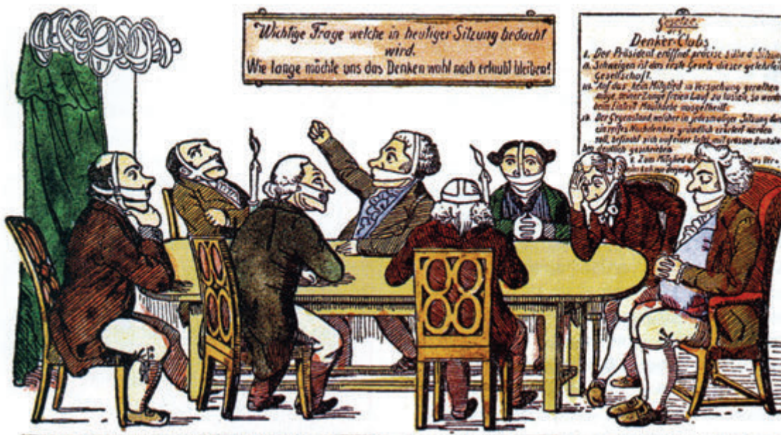
Fig. 6 — The Club of Thinkers, anonymous caricature dating to c. 1820.

What is the caricaturist trying to depict?