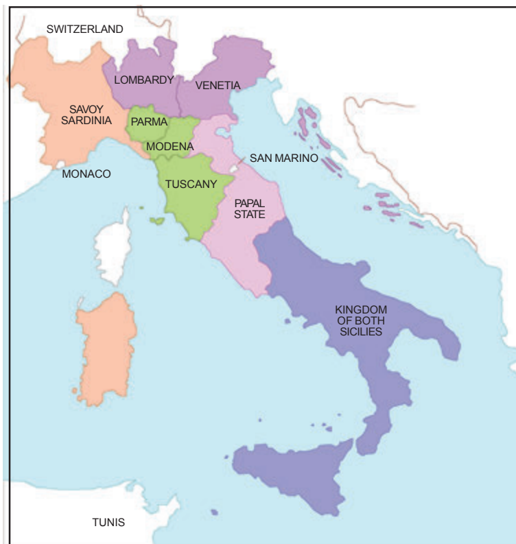
Fig. 14(a) — Italian states before unification, 1858.

Chief Minister Cavour who led the movement to unify the regions of Italy was neither a revolutionary nor a democrat. Like many other wealthy and educated members of the Italian elite, he spoke French much better than he did Italian. Through a tactful diplomatic alliance with France engineered by Cavour, Sardinia-Piedmont succeeded in defeating the Austrian forces in 1859. Apart from regular troops, a large number of armed volunteers under the leadership of Giuseppe Garibaldi joined the fray. In 1860, they marched into South Italy and the Kingdom of the Two Sicilies and succeeded in winning the support of the local peasants in order to drive out the Spanish rulers. In 1861 Victor Emmanuel II was proclaimed king of united Italy. However, much of the Italian population, among whom rates of illiteracy were very high, remained blissfully unaware of liberal-nationalist ideology. The peasant masses who had supported Garibaldi in southern Italy had never heard of Italia , and believed that La Talia was Victor Emmanuel's wife!