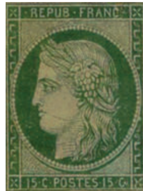
Fig. 16 — Postage stamps of 1850 with the figure of Marianne representing the Republic of France.

Allegory – When an abstract idea (for instance, greed, envy, freedom, liberty) is expressed through a person or a thing. An allegorical story has two meanings, one literal and one symbolic