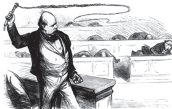
Fig. 13 — Caricature of Otto von Bismarck in the German reichstag (parliament), from Figaro, Vienna, 5 March 1870.

During the 1830s, Giuseppe Mazzini had sought to put together a coherent programme for a unitary Italian Republic. He had also formed a secret society called Young Italy for the dissemination of his goals. The failure of revolutionary uprisings both in 1831 and 1848 meant that the mantle now fell on Sardinia-Piedmont under its ruler King Victor Emmanuel II to unify the Italian states through war. In the eyes of the ruling elites of this region, a unified Italy offered them the possibility of economic development and political dominance.