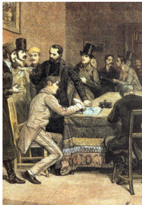
Fig. 7 — Giuseppe Mazzini and the founding of Young Europe in Berne 1833. Print by Giacomo Mantegazza.

One such individual was the Italian revolutionary Giuseppe Mazzini. Born in Genoa in 1807, he became a member of the secret society of the Carbonari. As a young man of 24, he was sent into exile in 1831 for attempting a revolution in Liguria. He subsequently founded two more underground societies, first, Young Italy in Marseilles, and then, Young Europe in Berne, whose members were like-minded young men from Poland, France, Italy and the German states. Mazzini believed that God had intended nations to be the natural units of mankind. So Italy could not continue to be a patchwork of small states and kingdoms. It had to be forged into a single unified republic within a wider alliance of nations. This unification alone could be the basis of Italian liberty. Following his model, secret societies were set up in Germany, France, Switzerland and Poland. Mazzini's relentless opposition to monarchy and his vision of democratic republics frightened the conservatives. Metternich described him as 'the most dangerous enemy of our social order'.