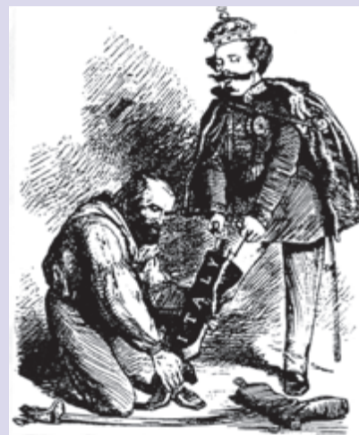
Fig. 15 – Garibaldi helping King Victor Emmanuel II of Sardinia-Piedmont to pull on the boot named ‘Italy’. English caricature of 1859.

In 1867, Garibaldi led an army of volunteers to Rome to fight the last obstacle to the unification of Italy, the Papal States where a French garrison was stationed. The Red Shirts proved to be no match for the combined French and Papal troops. It was only in 1870 when, during the war with Prussia, France withdrew its troops from Rome that the Papal States were finally joined to Italy.