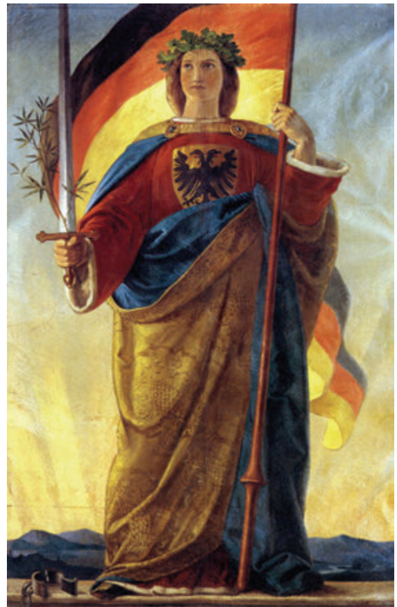
Fig. 17 — Germania, Philip Veit, 1848. The artist prepared this painting of Germania on a cotton banner, as it was meant to hang from the ceiling of the Church of St Paul where the Frankfurt parliament was convened in March 1848.