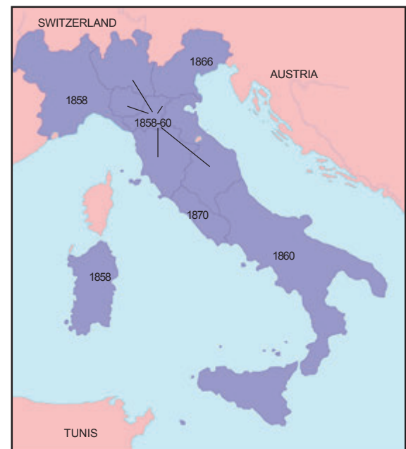
Fig. 14(b) — Italy after unification. The map shows the year in which different regions (seen in Fig 14(a)) become part of a unified Italy.

Examine Fig. 14(b). Which was the first region to become a part of unified Italy? Which was the last region to join? In which year did the largest number of states join?