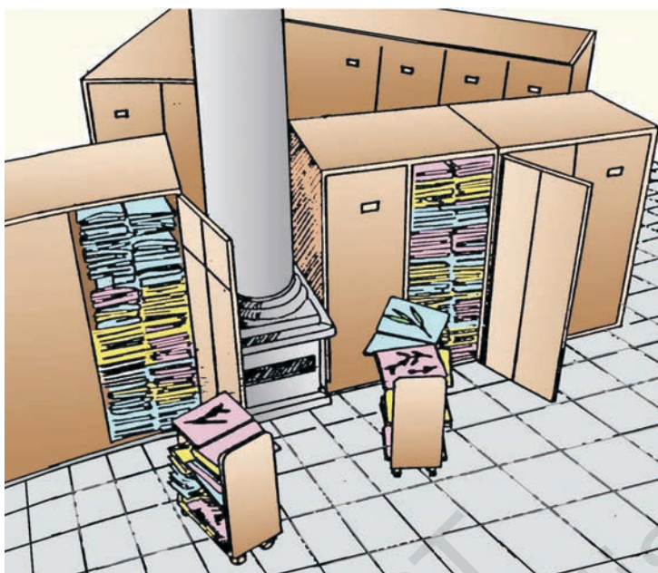
Figure 1.2 Herbarium showing stored specimens

according to a universally accepted system of classification. These specimens, along with their descriptions on herbarium sheets, become a store house or repository for future use (Figure 1.2). The herbarium sheets also carry a label providing information about date and place of collection, English, local and botanical names, family, collector's name, etc. Herbaria also serve as quick referral systems in taxonomical studies.