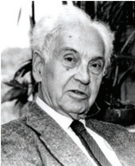
Ernst Mayr (1904 – 2004)

Born on 5 July 1904, in Kempten, Germany, ERNST MAYR, the Harvard University evolutionary biologist who has been called 'The Darwin of the 20 th century', was one of the 100 greatest scientists of all time. Mayr joined Harvard's Faculty of Arts and Sciences in 1953 and retired in 1975, assuming the title Alexander Agassiz Professor of Zoology Emeritus . Throughout his nearly 80-year career, his research spanned ornithology, taxonomy, zoogeography, evolution, systematics, and the history and philosophy of biology. He almost single-handedly made the origin of species diversity the central question of evolutionary biology that it is today. He also pioneered the currently accepted definition of a biological species. Mayr was awarded the three prizes widely regarded as the triple crown of biology: the Balzan Prize in 1983, the International Prize for Biology in 1994, and the Crafoord Prize in 1999. Mayr died at the age of 100 in the year 2004.