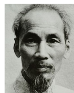
Ho Chi Minh

The mainstream political party in Indo-China was the Vietnam Nationalist Party. Formed in 1927, it was composed of the wealthy and middle class sections of the population. In 1929 the Vietnamese soldiers