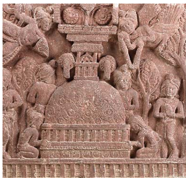
Stupa worship, Bharhut

was collective in nature and at times only a specific portion of the monument is said to have been patronised by a particular patron. Traders recorded their donation along with their place of origin.