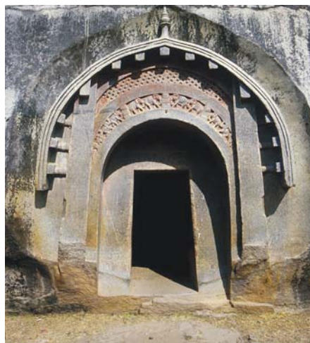
Lomesh Rishi cave-entrance detail