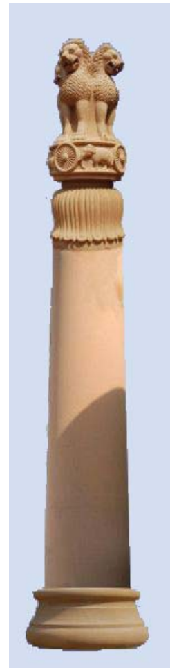
Pillar capital and abacus with stylised lotus

Construction of stupas and viharas as part of monastic establishments became part of the Buddhist tradition. However, in this period, apart from stupas and viharas , stone pillars, rock-cut caves and monumental figure sculptures were carved at several places. The tradition of constructing pillars is very old and it may be observed that erection of pillars was prevalent in the Achaemenian empire as well. But the Mauryan pillars are different from the Achaemenian pillars. The Mauryan pillars are rock-cut pillars thus displaying the carver's skills, whereas the Achaemenian pillars are constructed in pieces by a mason. Stone pillars were erected all over the Mauryan Empire with inscriptions engraved on them. The top portion of the pillar was carved with capital figures like the bull, the lion, the elephant, etc. All the capital figures are vigorous