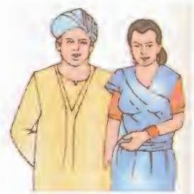
Dress of Assam

The Assamese women wear long skirts called mekhala, alongwith riha and a duppatta called chadar. The Assamese men wear dhoti and kurta. They are fond of eating rice, fish, chapati and vegetables.