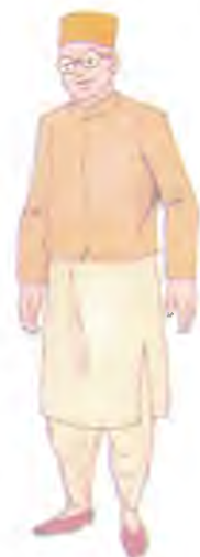
Dress of Bihar

The men of Maharashtra wear dhotis, kurtas and caps or turbans. The women wear sarees tied in a special way. They wear flowers in their hair. When they wear sarees it comes up