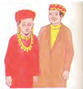
Dress of Himachal Pradesh

As the name suggests, the state also has cold weather so people wear warm clothes. The warm coats the people wear here are known as cholas. Beautifully embroidered caps of men and scarves of women are known as dhazu. They also love to sing and dance.