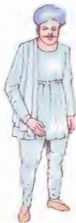
Dress of Rajasthan