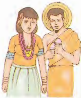
Dress of Nagaland

A large number of tribal people are seen here. They prefer to wear colourful clothes and have their own customs.