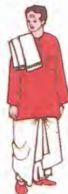
Dress of Kerala