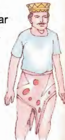
Dress of Goa

Rice, vegetables, sea food and meat are their favourite dishes. The Goans like to sing and dance and lead a happy life.