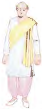
Dress of West Bengal