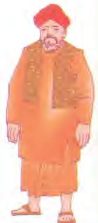
Dress of Punjab

The Punjabi men wear lungi or kurta-pyjama and a head gear pagdi or safa. Most women wear salwar-kurta or salwar-kameez with duppatta. The people of Punjab prefer to wear colourful clothes. The most popular dances of Punjab are Bhangra and Gidda.