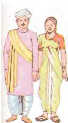
Dress of Maharashtra

The people of Bihar wear dhoti-kurta (men) and sarees (women). The favourite dishes are rice, chapati, dals, vegetables and fish. Thekua, the sweet dish and madhubani painting of Bihar are famous.