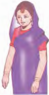
Dress of Gujrat

The most famous dances of Gujrat are the Garbha and the Dandiya Ras. Gujrati peopl like to eat rice, puri, dals, vegetables, curd and pickles. Their most famous dish is dhokla.