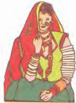
Dress of Haryana

Their main food is roti and dal with butter or ghee. They also take a lot of curd. They all like lassi and milk.