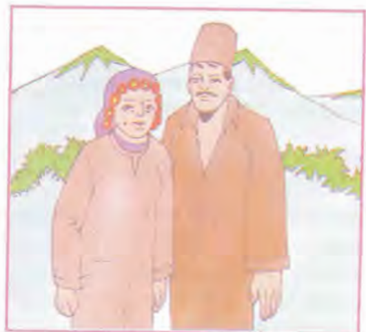
A Kashmiri couple

Kashmir Division has a very cold climate. The people here need to wear dresses which completely cover their bodies. For this, they wear long loose coats called phirans and salwars. This woolen fabric protects the Kashmiri people from the cold. The women wear veils and the men wear fur caps. Ladies wear a lot of silver jewellery. The Kashmiri people love to