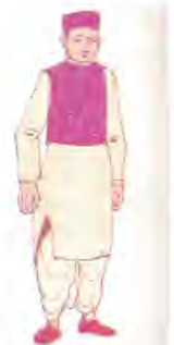
Dress of Uttar Pradesh

Generally the climate of this state is of normal temperature. The traditional dress of Uttar Pradesh is dhoti or kurta-pyjamas and caps for men and saree-blouse for women. Men also wear trousers and shirts. Salwar-suits are also worn by women. Village women wear colourful ghagra-choli. The usual diet of people includes roti, rice, dals and vegetables.