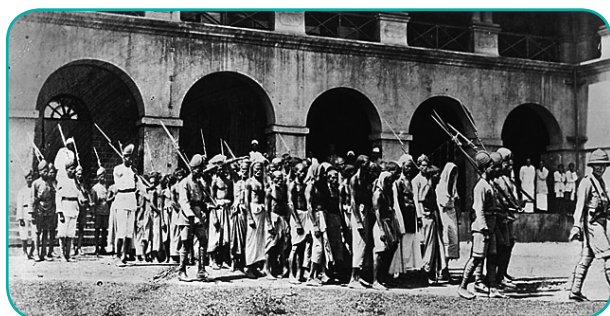
Malabar Rebellion, 1921

The bloody Malabar rebellion of 1921, where Muslim peasants were pitted against both the British rulers and Hindu landlords, gave another reason for the renewed campaign of the Hindu Mahasabha. Though the outbreak was basically an agrarian revolt, communal passion ran high in consequence of which Gandhi himself viewed it as a Hindu-Muslim conflict. Gandhi wanted Muslim leaders to tender a public apology for the happenings in Malabar.