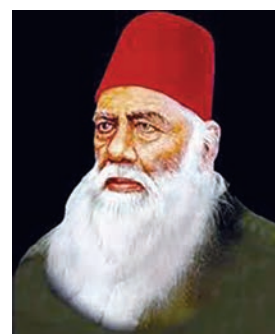
Sir Syed Ahmed Khan

Sir Syed Ahmed Khan, the founder of Aligarh movement was initially supportive of the Congress. Soon he was converted to the thinking that in a country governed by Hindus, Muslims would be helpless, as