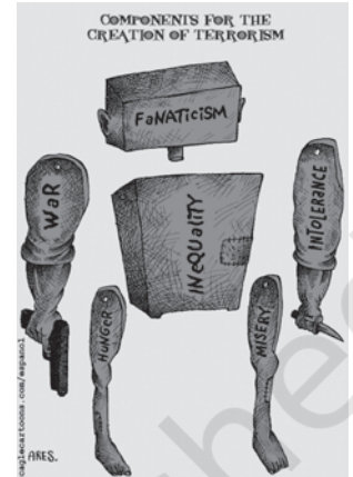
Components for the Creation of Terrorism

List the names of a few Nobel Peace Prize winners. Write a note on any one of them.