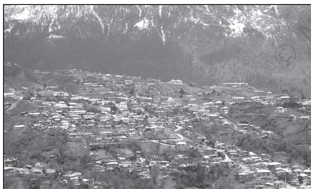
Fig. 4.1 : Clustered Settlements in the North-eastern states

The clustered rural settlement is a compact or closely built up area of houses. In this type of village the general living area is distinct and separated from the surrounding farms, barns and pastures. The closely built-up area and its