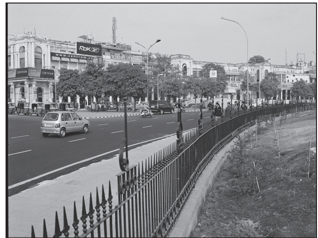
Fig. 4.4 : A view of the modern city

The British and other Europeans have developed a number of towns in India. Starting their foothold on coastal locations, they first developed some trading ports such as Surat, Daman, Goa, Pondicherry, etc. The British later consolidated their hold around three principal nodes – Mumbai (Bombay), Chennai (Madras), and Kolkata (Calcutta) – and built them in the British style. Rapidly