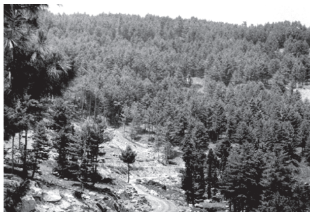
Figure 5.5 : Montane Forests

The Himalayan ranges show a succession of vegetation from the tropical to the tundra, which change in with the altitude. Deciduous forests are found in the foothills of the Himalayas. It is succeeded by the wet temperate type of forests between an altitude of 1,000-2,000 m. In the higher hill ranges of northeastern India, hilly areas of West Bengal and Uttaranchal, evergreen broad leaf trees such as oak and chestnut are predominant. Between 1,500-1,750 m, pine forests are also well-developed in this zone, with Chir Pine as a very useful commercial tree. Deodar, a highly valued endemic species grows mainly in the western part of the Himalayan range. Deodar is a durable wood mainly used in construction activity. Similarly, the chinar and the walnut, which sustain the famous Kashmir handicrafts, belong to this zone. Blue pine and spruce appear at altitudes of 2,225-3,048 m. At many places in this zone, temperate grasslands are also found. But in the higher reaches there is a transition to Alpine forests and pastures. Silver firs, junipers, pines, birch and rhododendrons, etc. occur between 3,000-4,000 m. However, these pastures are used extensively for transhumance by tribes like the Gujjars, the Bakarwals, the Bhotiyas and the Gaddis. The southern slopes of the Himalayas carry a thicker vegetation cover because of relatively higher precipitation than the drier north-facing slopes. At higher altitudes, mosses and lichens form part of the tundra vegetation.