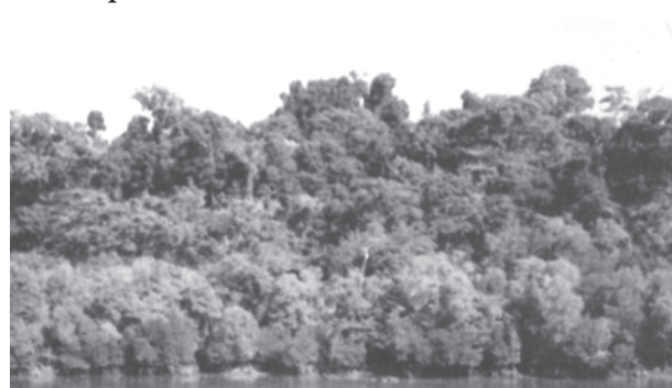
Figure 5.1 : Evergreen Forest

The semi evergreen forests are found in the less rainy parts of these regions. Such forests have a mixture of evergreen and moist deciduous trees. The undergrowing climbers provide an evergreen character to these forests. Main species are white cedar, hollock and kail.