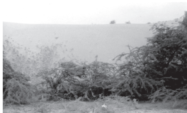
Figure 5.4 : Tropical Thorn Forests

Tropical thorn forests occur in the areas which receive rainfall less than 50 cm. These consist of a variety of grasses and shrubs. It includes semi-arid areas of south west Punjab, Haryana, Rajasthan, Gujarat, Madhya Pradesh and Uttar Pradesh. In these forests, plants remain leafless for most part of the year and give an expression of scrub vegetation. Important species found are babool , ber , and wild date palm, khair , neem , khejri , palas , etc. Tussocky grass grows upto a height of 2 m as the under growth.