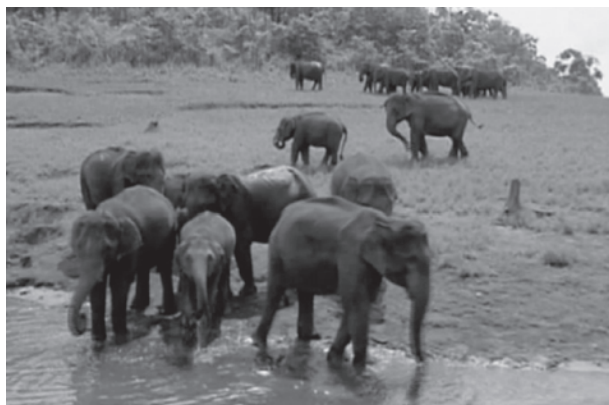
Figure 5.7 : Elephants in their Natural Habitat