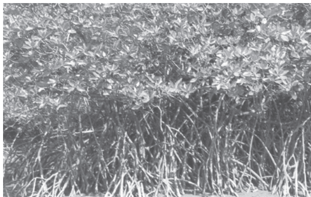
Figure 5.6 : Mangrove Forests

They consist of a number of salt-tolerant species of plants. Crisscrossed by creeks of stagnant water and tidal flows, these forests give shelter to a wide variety of birds.