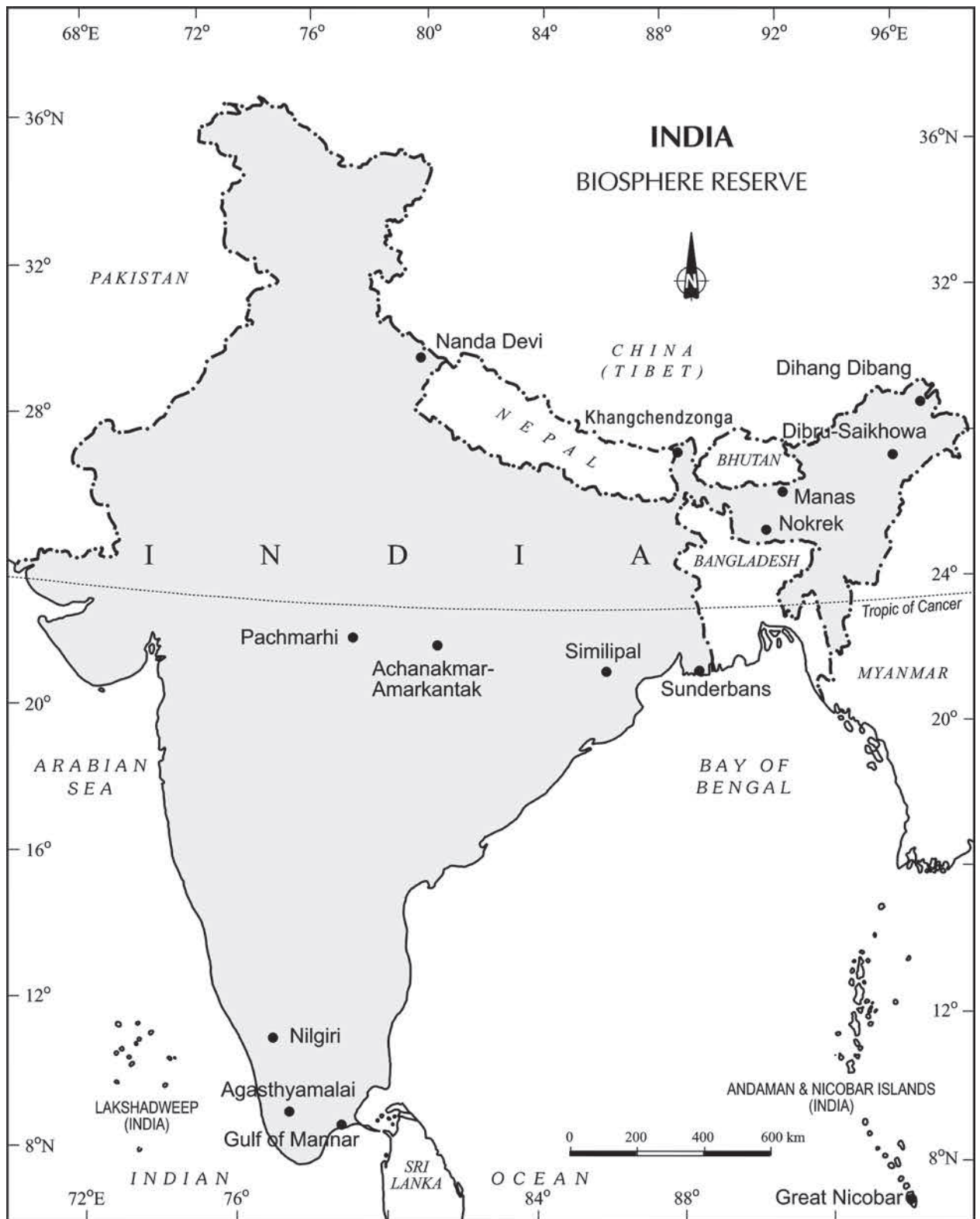
Figure 5.9 : India : Biosphere Reserves