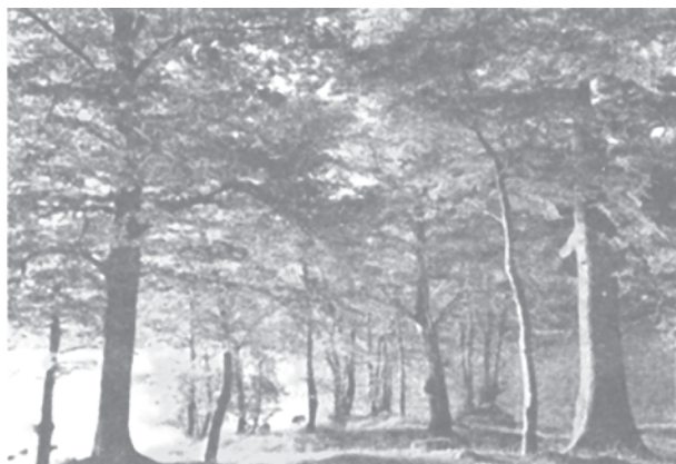
Figure 5.3 : Deciduous Forests

These are the most widespread forests in India. They are also called the monsoon forests. They spread over regions which receive rainfall between 70-200 cm. On the basis of the availability of water, these forests are further divided into moist and dry deciduous.