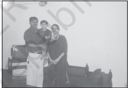
Notice how families and residences are different