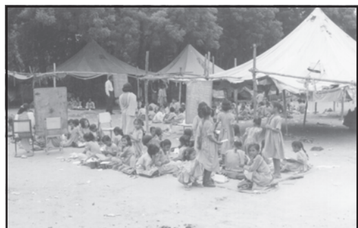
Discuss the visuals (Two types of schools)