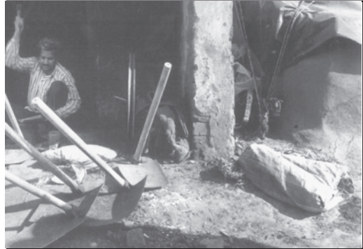
Work and Home