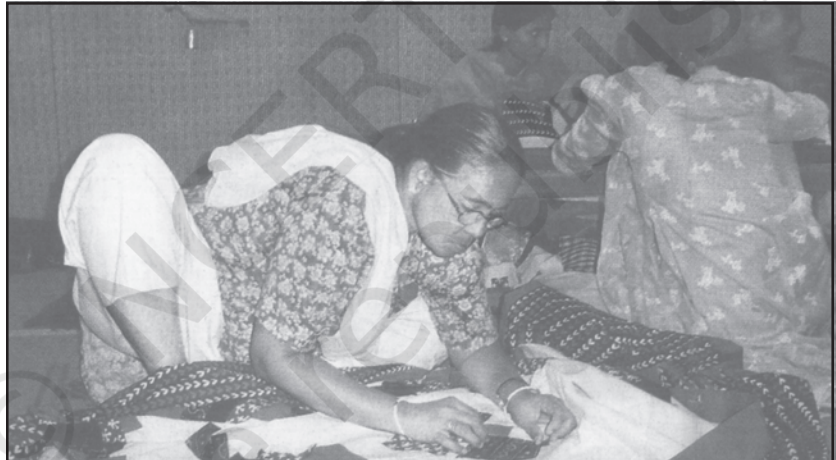
Different Types of Work

physical effort, which has as its objective the production of goods and services that cater to human needs.