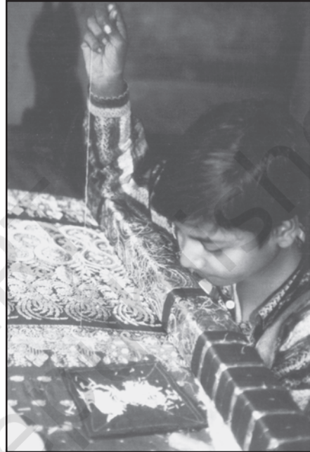
Discuss the visual

The report indicates how gender and caste discrimination impinge upon the chances of education. Recall how we began this book in Chapter 1 about a child's chances for a good job