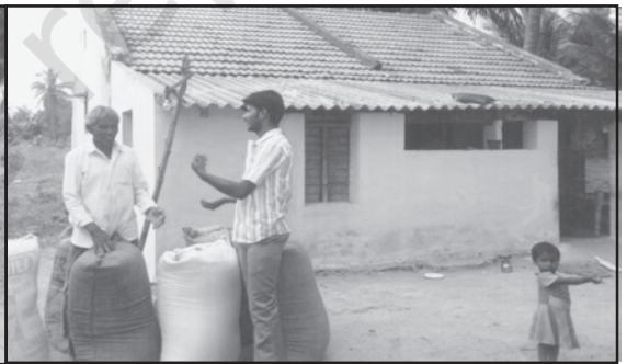
Threshing of paddy in a village