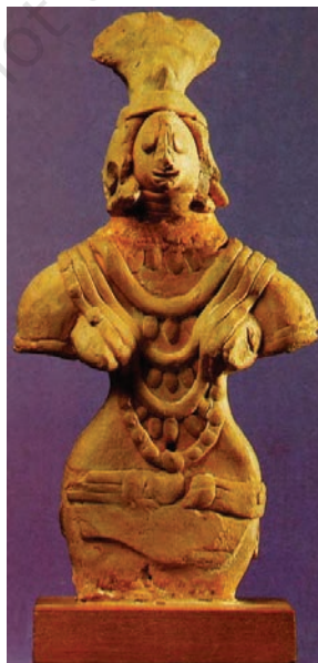
Mother goddess, terracotta

The art of bronze-casting was practised on a wide scale by the Harappans. Their bronze statues were made using the 'lost wax' technique in which the wax figures were first covered with a coating of clay and allowed to dry. Then the wax was heated and the molten wax was drained out through a tiny hole made in the clay cover. The hollow mould thus created was filled with molten metal which took the original shape of the object. Once the metal cooled, the clay cover was completely removed. In bronze we find human as well as animal figures, the best example of the former being the statue of a girl popularly titled 'Dancing Girl'. Amongst animal figures in bronze the buffalo with its uplifted head, back and sweeping horns and the goat are of artistic merit. Bronze casting was popular at all the major centres of the Indus Valley Civilisation. The copper dog and bird of Lothal and the bronze figure of a bull from Kalibangan are in no way inferior to the human figures of copper and bronze from Harappa and Mohenjodaro. Metal-casting appears to be a continuous tradition. The late Harappan and Chalcolithic sites like Daimabad in Maharashtra yielded excellent examples of metal-cast