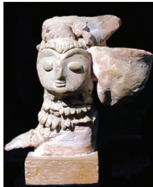
A terracotta figurine