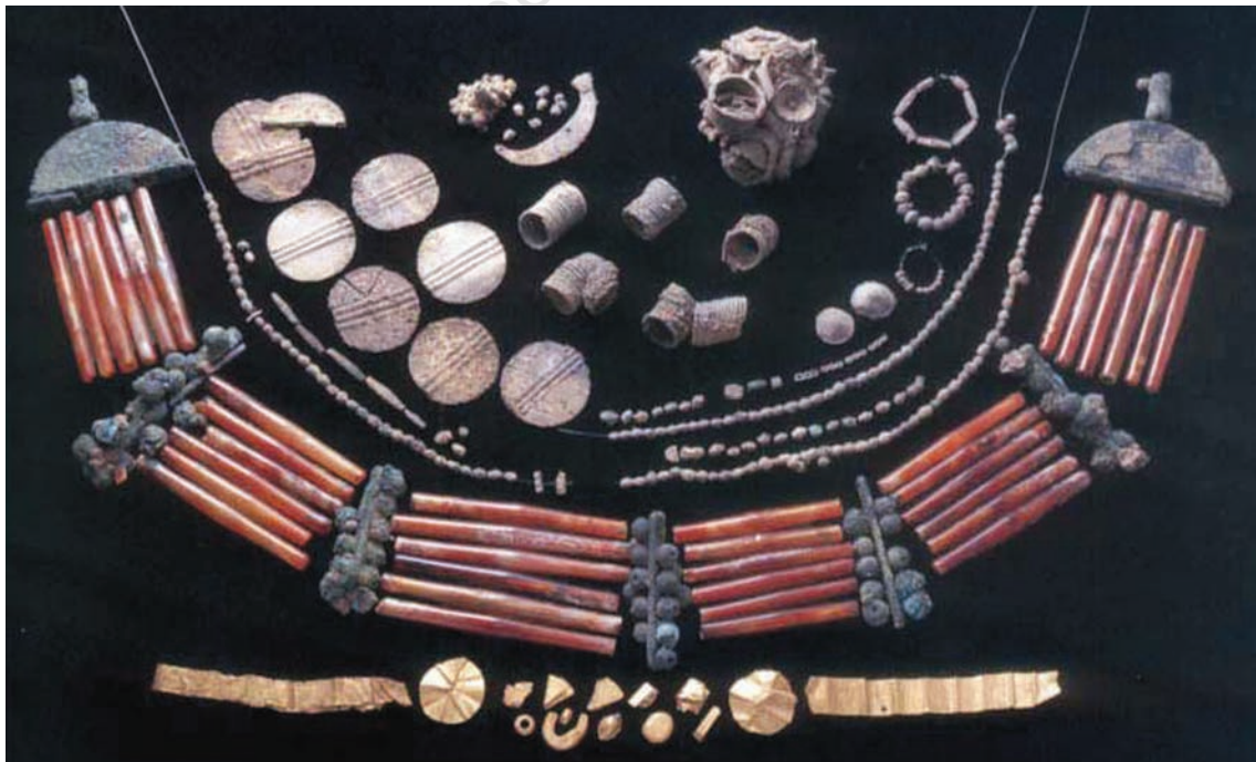
Beadwork and jewellery items

It is evident from the discovery of a large number of spindles and spindle whorls in the houses of the Indus