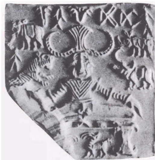
Pashupati seal/female deity

goat and also monsters. Sometimes trees or human figures were also depicted. The most remarkable seal is the one depicted with a figure in the centre and animals around. This seal is generally identified as the Pashupati Seal by some scholars whereas some identify it as the female deity. This seal depicts a human figure seated cross-legged. An elephant and a tiger are depicted to the right side of the seated figure, while on the left a rhinoceros and a buffalo are seen. In addition to these animals two antelopes are shown below the seat. Seals such as these date from between 2500 and 1900 BCE and were found in considerable numbers in sites such as the ancient city of Mohenjodaro in the Indus Valley. Figures and animals are carved in intaglio on their surfaces.