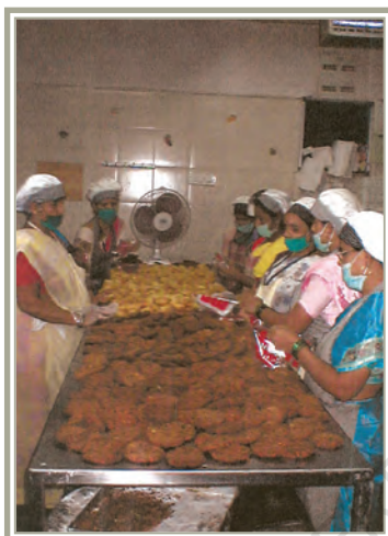
Quantity Food Preparation by a Women's group

consumers as well as are source of employment. Also, these services have tremendous economic significance to the country. Hotels and catering services support the tourist, travel and holiday industries. It is a major earner of foreign exchange since this industry brings money into the country in exchange for its services. Through the tourism industry, hoteliers and caterers indirectly contribute to advancing understanding between different countries.