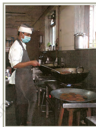
Food Production in a School Canteen

Examples of establishments that undertake food service and sales are given in Table 4.1.