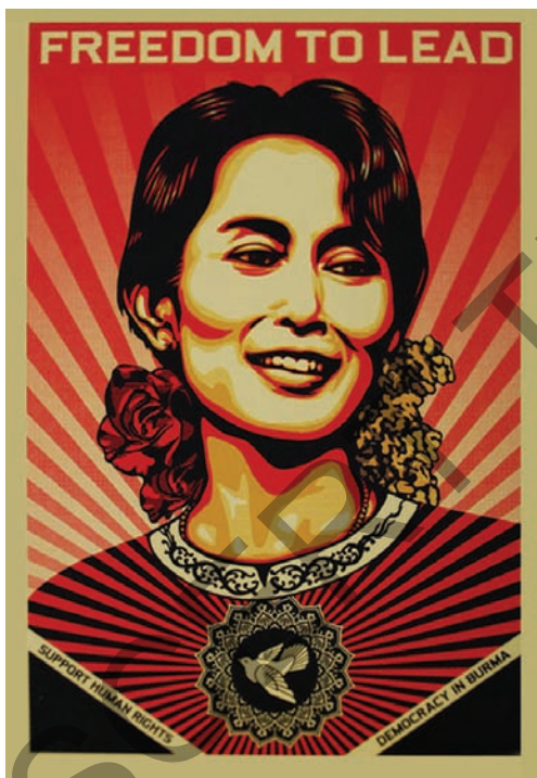
Aung San Suu Kyi: A poster from Myanmar supporting Democracy.

Students usually took the lead in staging protest against the military rule but all such protests were suppressed by the army. In 1988, a major protest against the army rule broke out and was brutally suppressed by killing thousands of demonstrators. A new military council took over the power in the following year promising elections. It was around this time that Aung San Suu Kyi (pronounced Su Chi) began to fight for reforms in Burma. Suu Kyi has since been a central figure in the protests and the struggle for the establishment of democracy in Burma.