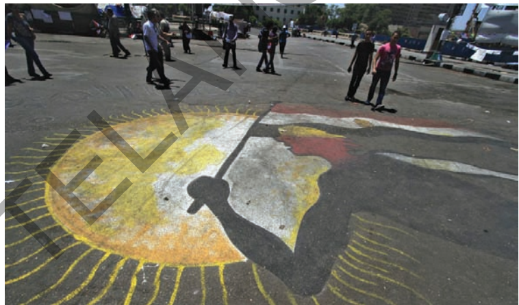
Fig. 17.2: A street painting in Egypt, another country where democratic movement occurred during this decade.

In the latter half of 2010, there were movements to establish democratic governments across the Arab world. It began with a small country, Tunisia, and spread to Egypt, Libya, Yemen, Bahrain and Syria amongst others. This revolutionary wave of demonstrations, protests, and wars taking place in the Arab world that began in December 2010 is now famous as the 'Arab Spring'.