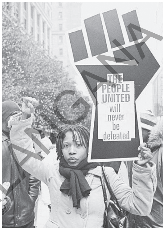
Fig. 17.1: Peoples' protest