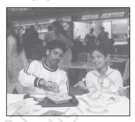
Discuss how the visual captures a way of life

habits acquired by man as a member of society" (Tylor 1871).