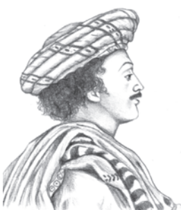
Raja Ram Mohun Roy