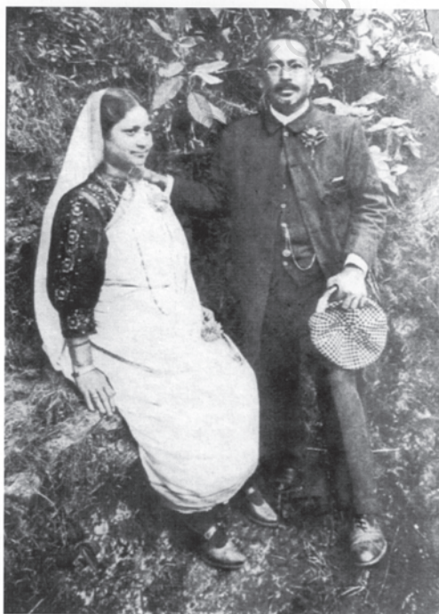
The mix and match of the traditional and modern

of cloth was differently worn in different regions. The standard way that the modern middle class woman wears it was a novel combination of the traditional sari with the western 'petticoat' and 'blouse'.