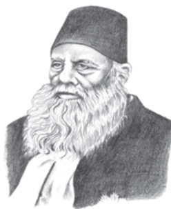
Sir Syed Ahmed Khan

You have already seen the far-reaching impact of colonialism on our lives. The social reform movements which emerged in India in the 19 th century arose to the challenges that colonial Indian society faced. You probably are familiar with what were termed social evils that plagued Indian society. The well-known issues are that of sati ,