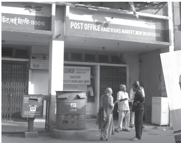
New technologies and organisations that speeded up various forms of communication

New technologies speeded up various forms of communication. The printing press, telegraph, and later the microphone, movement of people and goods through steamship and railways helped quick movement of new ideas. Within India, social reformers from Punjab and Bengal exchanged ideas with reformers from Madras and Maharashtra. Keshav Chandra Sen of Bengal visited Madras in 1864. Pandita Ramabai travelled to different corners of the country. Some of them went to other countries. Christian missionaries reached remote corners of present day Nagaland, Mizoram and Meghalaya.