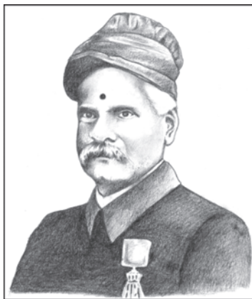
Raja Ravi Varma

Apart from ways of life and thinking the west influenced Indian art and literature. Artists like Ravi Varma, Abanindranath Tagore, Chandu Menon and Bankimchandra Chattopadhyaya were all grappling with the colonial encounter. The box below captures the many ways that style, technique and the very theme of an artist like Ravi Varma were shaped by western and indigeneous traditions. It discusses the portrait of a family in a matrilineal community of Kerala but one that significantly resembles the very typical patrilineal nuclear family of the modern west consisting of the father, mother and children.