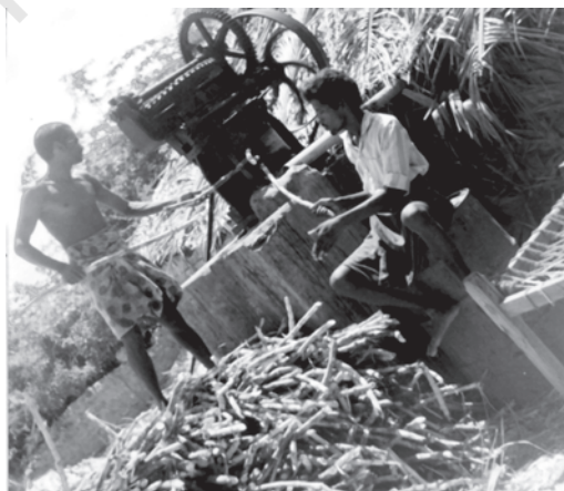
Fig. 6.2 Jaggery making is an allied activity of the farming sector

greater risk in depending exclusively on farming for livelihood. Diversification towards new areas is necessary not only to reduce the risk from agriculture sector but also to provide productive sustainable livelihood options to rural people. Much of the agricultural employment activities are concentrated in the Kharif season. But during the Rabi season, in areas where there are inadequate irrigation facilities, it becomes difficult to find gainful employment. Therefore expansion into other sectors is essential to provide supplementary gainful employment and in realising higher levels of income for rural people to overcome poverty and other tribulations. Hence, there is a need to focus on allied activities, non-farm employment and other emerging alternatives of livelihood, though there are many other options available for providing sustainable livelihoods in rural areas.