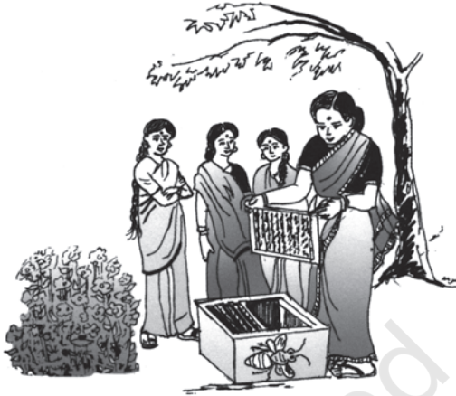
Fig. 6.5 Women in rural households take up bee-keeping as an entrepreneurial activity

Horticulture: Blessed with a varying climate and soil conditions, India has adopted growing of diverse horticultural crops such as fruits, vegetables, tuber crops, flowers, medicinal and aromatic plants, spices and plantation crops. These crops play a vital role in providing food and nutrition, besides addressing employment concerns. Horticulture sector contributes nearly one-third of the value of agriculture output and six per cent of Gross Domestic Product of India. India has emerged as a world leader in producing a variety of fruits like mangoes, bananas, coconuts, cashew nuts and a number of spices and is the second largest producer of fruits and vegetables. Economic condition of many farmers engaged in horticulture has improved and it has become a means of improving livelihood for many unprivileged classes. Flower