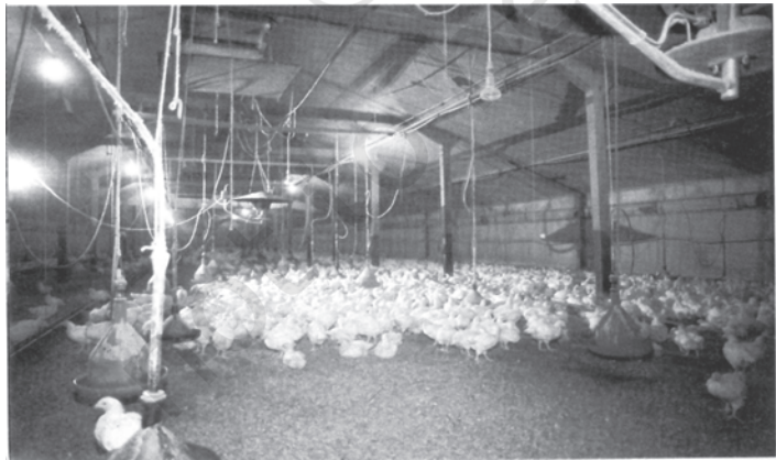
Fig. 6.4 Poultry has the largest share of total livestock in India

However problems related to over- fishing and