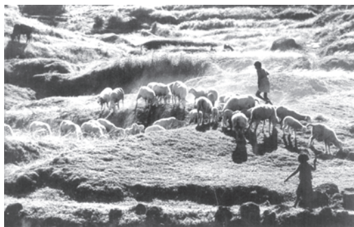
Fig. 6.3 Sheep rearing — an important income augmenting activity in rural areas

followed by others. Other animals which include camels, asses, horses, ponies and mules are in the lowest rung. India had about 303 million cattle, including 110 million buffaloes in 2019. Performance of the Indian dairy sector over the last three decades has been quite impressive. Milk production in the country has increased by about ten times between 1951-2016. This can be attributed mainly to the successful implementation of 'Operation Flood'. It is a system whereby all the farmers can pool their milk produced according to different grading (based on quality), processed and marketed to urban centres through cooperatives. In this system the farmers are assured of a fair price and income from the supply of milk to urban markets. As pointed out earlier Gujarat state is held as a success story in the efficient implementation of milk cooperatives which has been emulated by many states. Gujarat, Madhya Pradesh, Uttar Pradesh, Andhra Pradesh, Maharashtra, Punjab and Rajasthan, are major milk producing states. Meat,