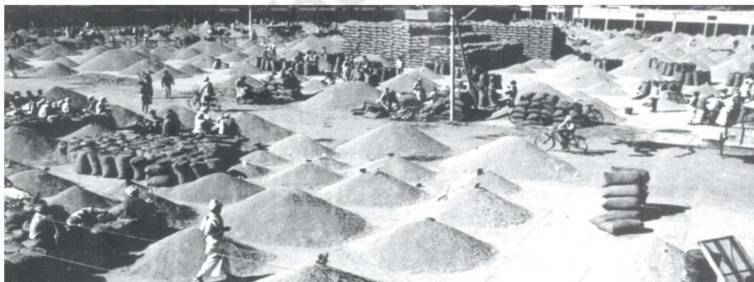
Fig. 6.1 Regulated market yards benefit farmers as well as consumers

Let us discuss four such measures that were initiated to improve the marketing aspect. The first step was regulation of markets to create orderly and transparent marketing conditions. By and large, this policy benefited farmers as well as consumers. However, there is still a need to develop about 27,000 rural periodic markets as regulated market places to realise the full potential of rural markets. Second component is provision of physical infrastructure facilities like roads, railways, warehouses, godowns, cold storages and processing units. The current infrastructure facilities are quite inadequate to meet the growing demand and need to be improved. Cooperative