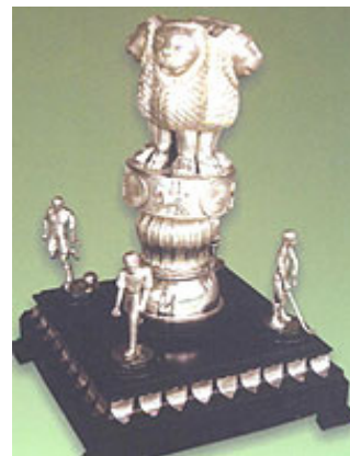
Fig. 13.5: Maka trophy