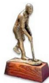
Fig. 13.4: Dhyan Chand award