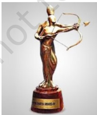
Fig. 13.2: Dronacharya award

The Rajiv Gandhi Khel Ratna award was instituted in the year 1991-92. It is India's highest honour given for achievement in sport. The words "Khel Ratna" literally mean "Sport Gem" in Hindi. The award is named after the late Rajiv Gandhi, former Prime Minister of India. It carries a medal, a scroll of honour and a cash component of ₹ 7,50,000. The Khel Ratna was devised to be an overarching honour, conferred for outstanding sporting performance, whether by an individual or a team, across all sporting disciplines in a given year.