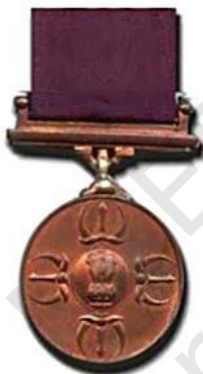
Fig. 13.1: Rajiv Gandhi Khel Ratna

Sport awards in India are presented by the Government of India to honour the players who have performed very well in their field of sport. It is bestowed to various sport personalities in different fields for their accomplishments and outstanding performances and to enhance the enthusiasm of players and recognise their skills and achievements. All the 7 awards are given to the proud recipient on National Sport Day every year i.e. 29 August to mark and celebrate the birthday of hockey Maestro Major Dhyanchand. These awards include the Trophy Rajiv Gandhi Khel Ratna Award, Arjuna Award, the Maulana Abul Kalam Azad (MAKA) Award, the, the Dronacharya Awards and the Dhyan Chand Award. Very recently the sport category also has been added in the list of areas for which Bharat Ratna is conferred.