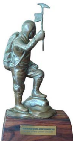
Fig. 13.7: TNNA Award