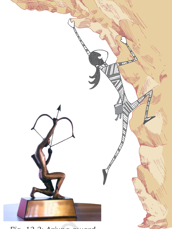
Fig. 13.3: Arjuna award

Government instituted MAKATrophy in 1956-57 as a tool for promoting the competitive sport amongst colleges and Universities. The top overall performing University in the Inter-University tournaments in India is given the MAKATrophy, which is a rolling trophy along with cash prize. The cash prize has also been recently enhanced to Rs.10 lakh, Rs. 5 lakh and Rs.3 lakh for the Universities securing first, second and third position respectively in Inter-University tournaments.