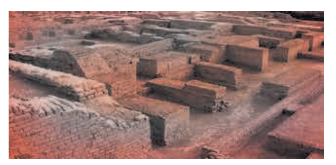
A multi-roomed house at Mohenjodaro

The remains at Mohenjodaro were considerably intact. So the glory of the city was revealed in way of the houses, majestic buildings, wide streets, etc. Thus the evidence of the impressive town planning, and public administration, characteristic of the Harappan civilisation came into light. The town planning of the Harappan cities can be easily compared with the town planning of a modern city like