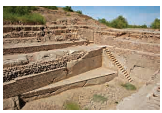
The Water Tank at Dholavira