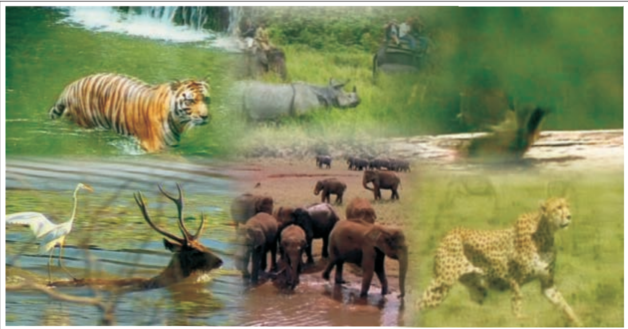
Figure 8.3 : Wildlife

In order to protect them many national parks, sanctuaries and biosphere reserves have been set up. The Government