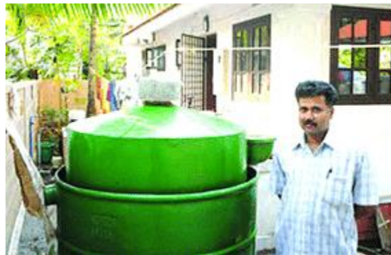
Gobar Gas from cattle refuse

Cattle continue to have great importance in Indian villages. It is necessary that facilities should be available for their treatment in the villages itself.