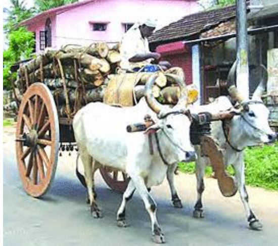
Healthy cattle are Farmer's asset

The bullock-cart is an all weather vehicle. It can go on kutcha roads and even in knee deep water. It can be repaired within the village. Fodder for the bullocks is available with the farmer. He need not go to the petrol pump or the garage. Tractors end up as scrap. But the cow leaves behind young ones who are again useful to us.