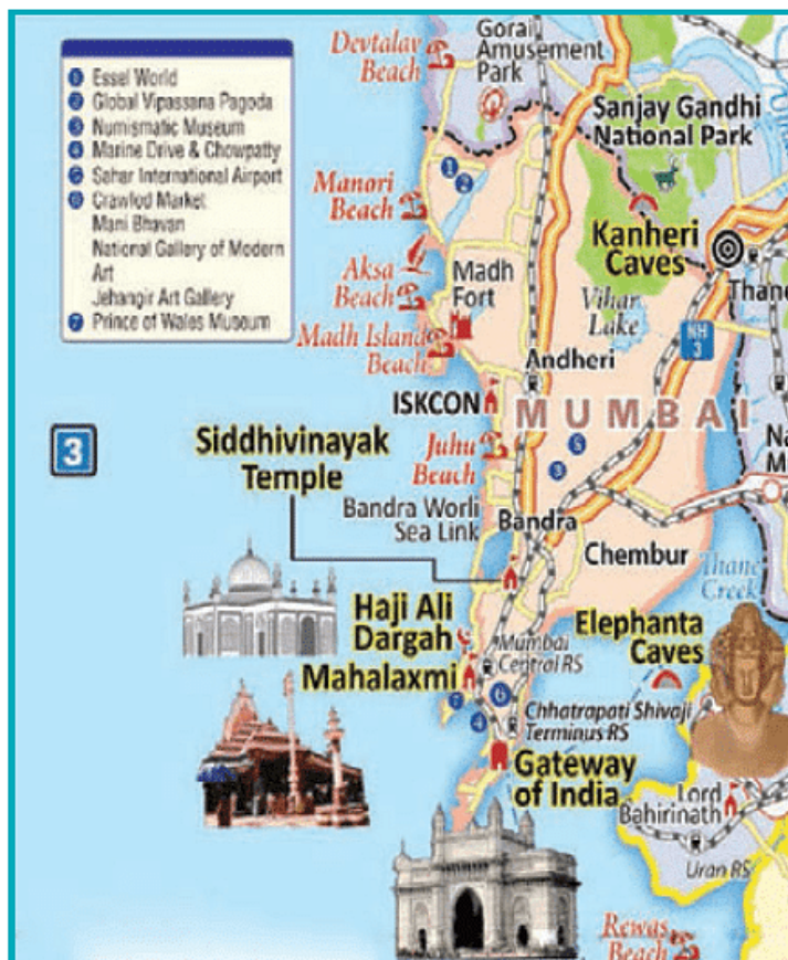
Map of Mumbai

Climate of Mumbai is hot and humid for most part of the year. It has very mild winter. It gets very heavy rain during the monsoon.