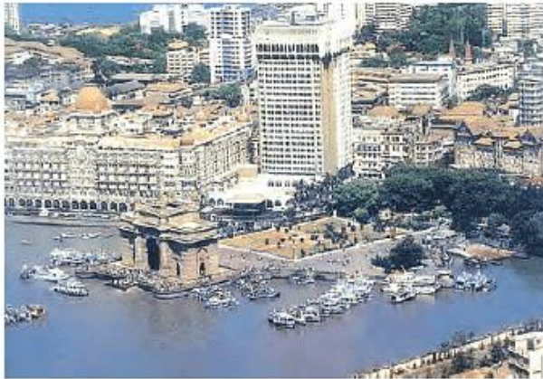
Mumbai, the capital of Maharashtra

Mumbai is the capital of Maharashtra. It is also called the financial capital of India. It was built by British. It is a very busy city. It has been the largest textile industry Centre and has many other industries but somehow it is more known for Hindi film industry. This is called Bollywood as opposed to Hollywood of the USA.