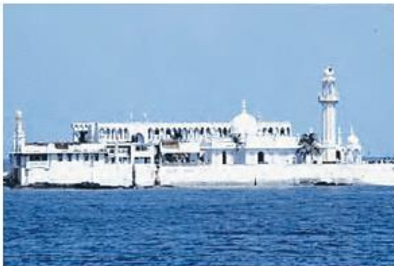
Haji Ali Dargah in the Sea

It is a very important harbour. Most of the land on which the township stands has been claimed from the sea.