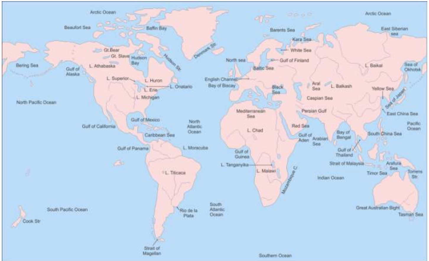
Map showing oceans, important seas, Lakes Bays and Gulfs