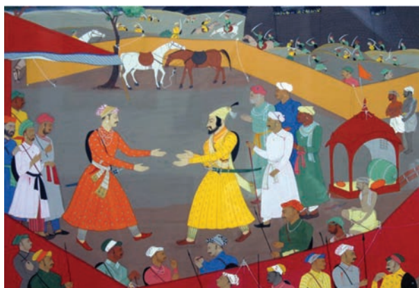
Shivaji and Jai Singh

In 1664, Shivaji attacked Surat, the major Mughal port in Arabian Sea and his soldiers plundered the city. Aurangzeb despatched an army under the command of the Rajput general Raja Jai Singh to defeat Shivaji and annex Bijapur. At that time, Prince Muazzam, (known as Bahadur Shah I), was the Governor of the Deccan. Jai Singh made elaborate plans to encircle Shivaji on all sides. Even Raigarh was under threat. Purandar was besieged in