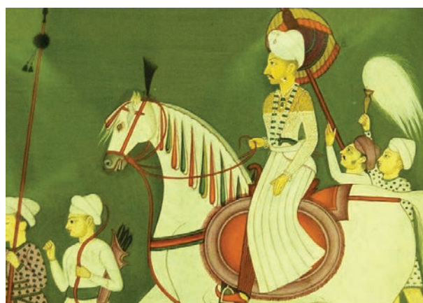
Balaji Baji Rao

Balaji Baji Rao succeeded as the Peshwa after the death of his father Baji Rao I. Known as Nana Sahib, he proved to be a good administrator and an expert in handling financial matters.