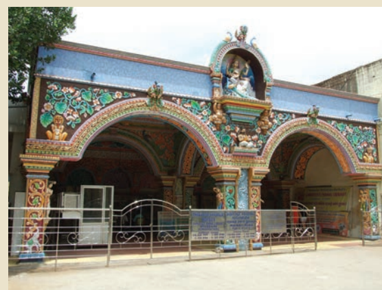
Saraswati Mahal library

The Saraswati Mahal library, built by the Nayak rulers and enriched by Serfoji II contains a record of the day-to-day proceedings of the Maratha court - as Modi documents, French-Maratha correspondence of the 18 th century. Modi was the script used to write the Marathi language. It is a treasure house of rare manuscripts and books in many languages