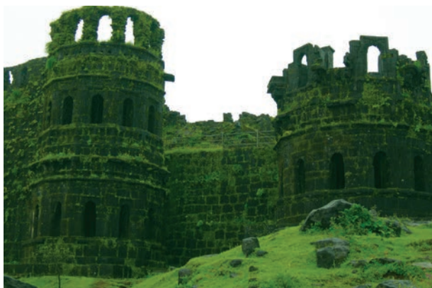
Raigarh (Raigad) Fort

On 6 June 1674, Shivaji was crowned at Raigarh. He assumed the title of “Chhatrapathi” (metaphor for “supreme king”).