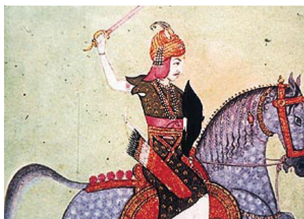
Baji Rao I

Thana, Salsette and Bassein were captured from the Portuguese in 1738 and they were driven out of the Konkan coast. At the same time, the English made friendly overtures to the Marathas and got the right to free trade in the Deccan region.