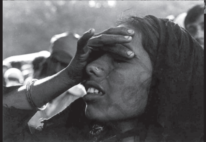
The next morning