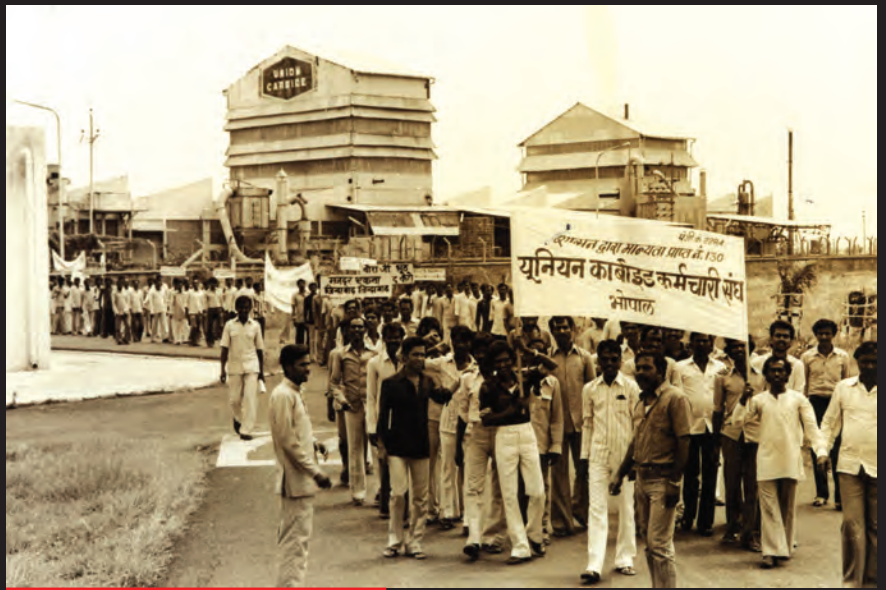
Members of UC Employees Union protesting

The disaster was not an accident. UC had deliberately ignored the essential safety measures in order to cut costs. Much before the Bhopal disaster, there had been incidents of gas leak killing a worker and injuring several.