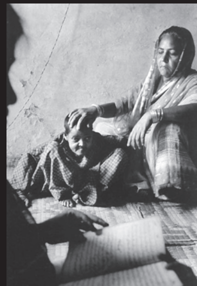
A child severely affected by the gas

Most of those exposed to the poison gas came from poor, working-class families, of which nearly 50,000 people are today too sick to work. Among those who survived, many developed severe respiratory disorders, eye problems and other disorders. Children developed peculiar abnormalities, like the girl in the photo.