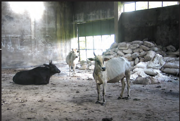
Bags of chemicals lie strewn around the UC plant

UC stopped its operations, but left behind tons of toxic chemicals. These have seeped into the ground, contaminating water. Dow Chemical, the company who now owns the plant, refuses to take responsibility for clean up.