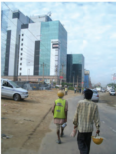
Accidents are common to construction sites. Yet, very often, safety equipment and other precautions are ignored.