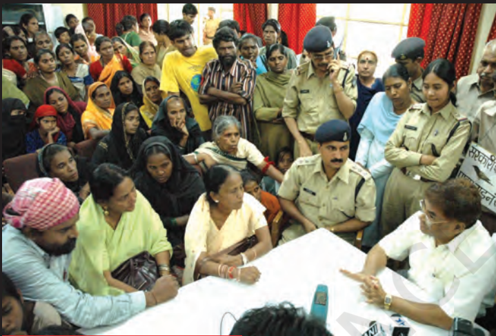
Gas victims with the Gas Relief Minister

Despite the overwhelming evidence pointing to UC as responsible for the disaster, it refused to accept responsibility.