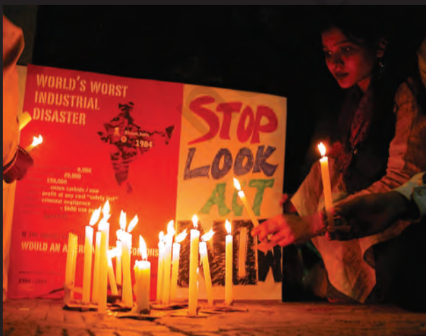
The struggle for justice goes on...

24 years later, people are still fighting for justice: for safe drinking water, for health-care facilities and jobs for the people poisoned by UC. They also demand that Anderson, the UC chairman who faces criminal charges, be prosecuted.