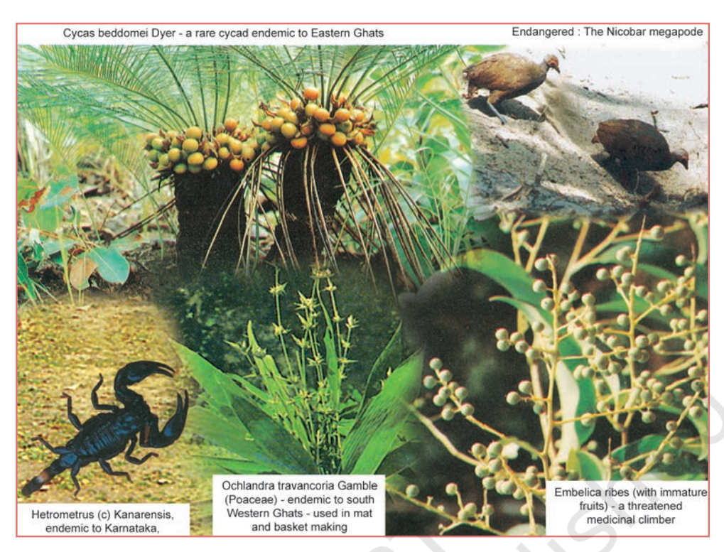
Fig. 2.2: A few extinct, rare and endangered species