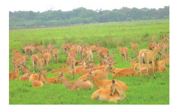
Fig. 2.4: Rhino and deer in Kaziranga National Park

horned rhinoceros, the Kashmir stag or hangul, three types of crocodiles – fresh water crocodile, saltwater crocodile and the Gharial , the Asiatic lion, and others. Most recently, the Indian elephant, black buck (chinkara), the great Indian bustard ( godawan ) and the snow leopard, etc. have been given full or partial legal protection against hunting and trade throughout India.