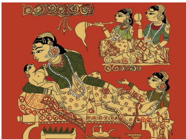
Jaina Painting portraying Mahavira's birth

Vardhamana was born around 540 BCE in Kundagrama, a suburb of Vaishali. He was a member of the ruling family of a gana-sangha and his father Siddhartha was the chief of the Jnatrika clan. His mother Trishala was a Lichchavi princess and sister of its chief Chetaka. Mahavira was closely connected to rulers of Magadha, Anga and Videha through his mother. From his childhood, he was attracted to spiritual life. After the death of his parents, he left his home at the age of 30 and wandered about as a mendicant for 12 years in search of true knowledge. He practiced severe austerities and discarded his garments. During the course of his wanderings, he met Gosala and spent six years with him before they parted due to differences. In the 13th year of his wandering, at the age of 42, Vardhamana attained enlightenment or Nirvana . He then became a Tirthankara and came to be called a Jina or Mahavira (the Great Conqueror). He preached for 30 years and was patronised by the rich and the elite. He died about 468 BCE at the age of 72 in Pavapuri near Rajgriha. He fasted