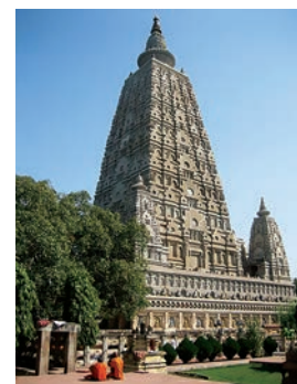
Mahabodhi temple, Gaya

Siddhartha wandered about and joined Alara Kalama as a disciple for a brief period. He also sought guidance from a hermit Uddaka Ramaputta. Siddhartha was not satisfied with their path and practised severe austerities, which left him nearly dead.