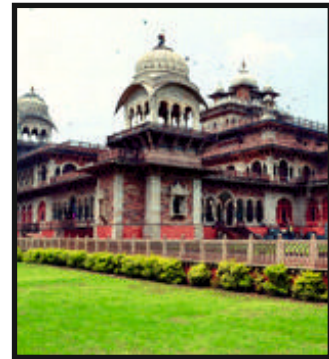
Albert Hall Museum