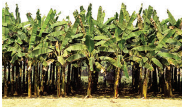
Fig. 4.2: Banana plantation in Southern part of India

In India, tea, coffee, rubber, sugarcane, banana, etc., are important plantation crops. Tea in Assam and North Bengal coffee in Karnataka are some of the important plantation crops grown in these states. Since the production is mainly for market, a well-developed network of transport and communication connecting the plantation areas, processing industries and markets plays an important role in the development of plantations.