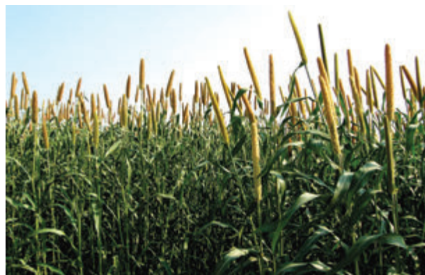
Fig. 4.6: Bajra Cultivation

Bajra grows well on sandy soils and shallow black soil. Major Bajra producing States are Rajasthan, Uttar Pradesh, Maharashtra, Gujarat and Haryana. Ragi is a crop of dry regions and grows well on red, black, sandy, loamy and shallow black soils. Major ragi producing states are: Karnataka, Tamil Nadu, Himachal Pradesh, Uttarakhand, Sikkim, Jharkhand and Arunachal Pradesh.