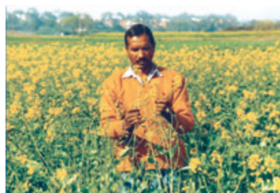
Fig. 4.9: Groundnut, sunflower and mustard are ready to be harvested in the field