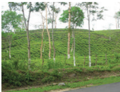
Fig. 4.10: Tea Cultivation

Coffee: Indian coffee is known in the world for its good quality. The Arabica variety initially brought from Yemen is produced in the country. This variety is in great demand all over the world. Initially its cultivation was introduced on the Baba Budan Hills and even today its cultivation is confined to the Nilgiri in Karnataka, Kerala and Tamil Nadu.