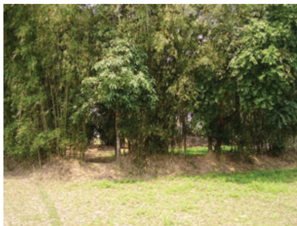
Fig. 4.3: Bamboo plantation in North-east