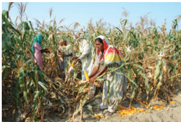
Fig. 4.7: Maize Cultivation

Maize: It is a crop which is used both as food and fodder. It is a kharif crop which requires temperature between 21°C to 27°C and grows well in old alluvial soil. In some states like Bihar maize is grown in rabi season also. Use of modern inputs such as HYV seeds, fertilisers and irrigation have contributed to the increasing production of maize. Major maize-producing states are Karnataka, Madhya Pradesh, Uttar Pradesh, Bihar, Andhra Pradesh and Telangana.