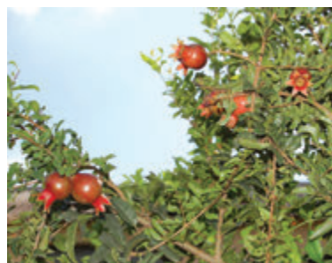
Fig. 4.12: Apricots, apple and pomegranate