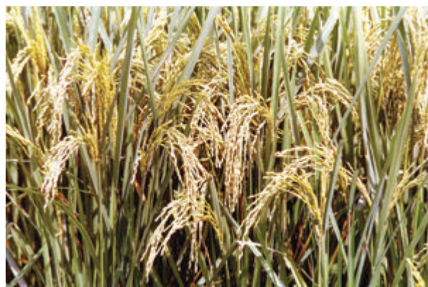
Fig. 4.4 (b): Rice is ready to be harvested in the field