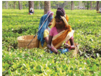
Fig. 4.11: Tea-leaves Harvesting

Horticulture Crops: In 2015, India was the second largest producer of fruits and vegetables in the world after China. India is a producer of tropical as well as temperate fruits. Mangoes of Maharashtra, Andhra Pradesh, Telangana, Uttar Pradesh and West Bengal, oranges of Nagpur and Cherrapunjee (Meghalaya), bananas of Kerala, Mizoram, Maharashtra and Tamil Nadu, lichi and guava of Uttar Pradesh and Bihar, pineapples of Meghalaya, grapes of Andhra Pradesh, Telangana and Maharashtra, apples, pears, apricots and walnuts of UT of Jammu and Kashmir, UT of Ladakh and Himachal Pradesh are in great demand the world over.