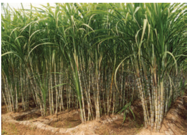
Fig. 4.8: Sugarcane Cultivation

Sugarcane: It is a tropical as well as a subtropical crop. It grows well in hot and humid climate with a temperature of 21°C to 27°C and an annual rainfall between 75cm. and 100cm. Irrigation is required in the regions of low rainfall. It can be grown on a variety of soils and needs manual labour from