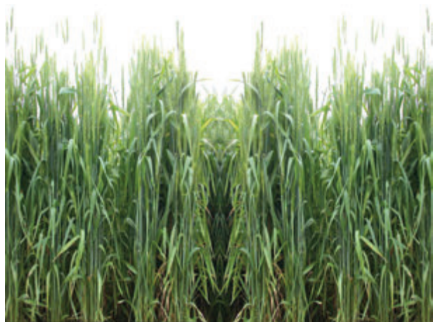
Fig. 4.5: Wheat Cultivation

Wheat: This is the second most important cereal crop. It is the main food crop, in north and north-western part of the country. This rabi crop requires a cool growing season and a bright sunshine at the time of ripening. It requires 50 to 75 cm of annual rainfall evenly-distributed over the growing season. There are two important wheat-growing zones in the country – the Ganga-Satluj plains in the north-west and black soil region of the Deccan. The major wheat-producing states are Punjab, Haryana, Uttar Pradesh, Madhya Pradesh, Bihar and Rajasthan.