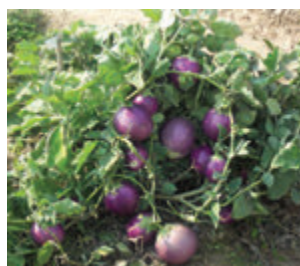
Fig. 4.13: Cultivation of vegetables – peas, cauliflower, tomato and brinjal