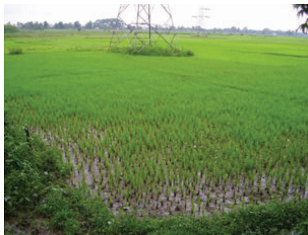
Fig. 4.4 (a): Rice Cultivation

Rice is grown in the plains of north and