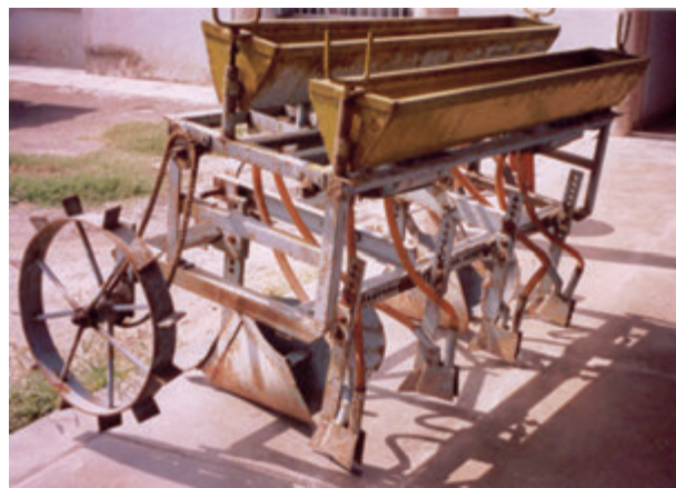
Fig. 4.15: Modern technological equipments used in agriculture

some of the strategies initiated to improve the lot of Indian agriculture. But, this too led to the concentration of development in few selected areas. Therefore, in the 1980s and 1990s, a comprehensive land development programme was initiated, which included both institutional and technical reforms. Provision for crop insurance against drought, flood, cyclone, fire and disease, establishment of Grameen banks, cooperative societies and banks for providing loan facilities to the farmers at lower rates of interest were some important steps in this direction.