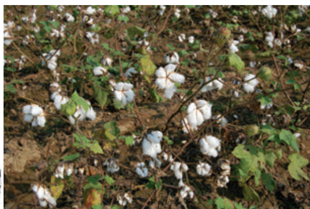
Fig. 4.14: Cotton Cultivation

Cotton: India is believed to be the original home of the cotton plant. Cotton is one of the main raw materials for cotton textile industry. In 2015, India was second largest producer of cotton after China. Cotton grows well in drier parts of the black cotton soil of the Deccan plateau. It requires high temperature, light rainfall or irrigation, 210 frost-free days and bright sun-shine for its