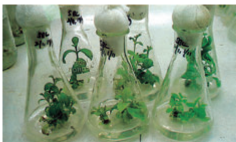
Fig. 4.16: Tissue culture of teak clones

countries because of the highly subsidised agriculture in those countries.