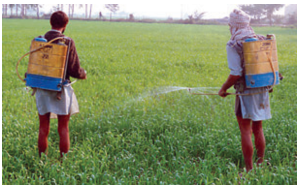
Fig. 4.17 Problems associated with heavy pesticide use are widely recognised in developed and developing countries

A few economists think that Indian farmers have a bleak future if they continue growing foodgrains on the holdings that grow smaller