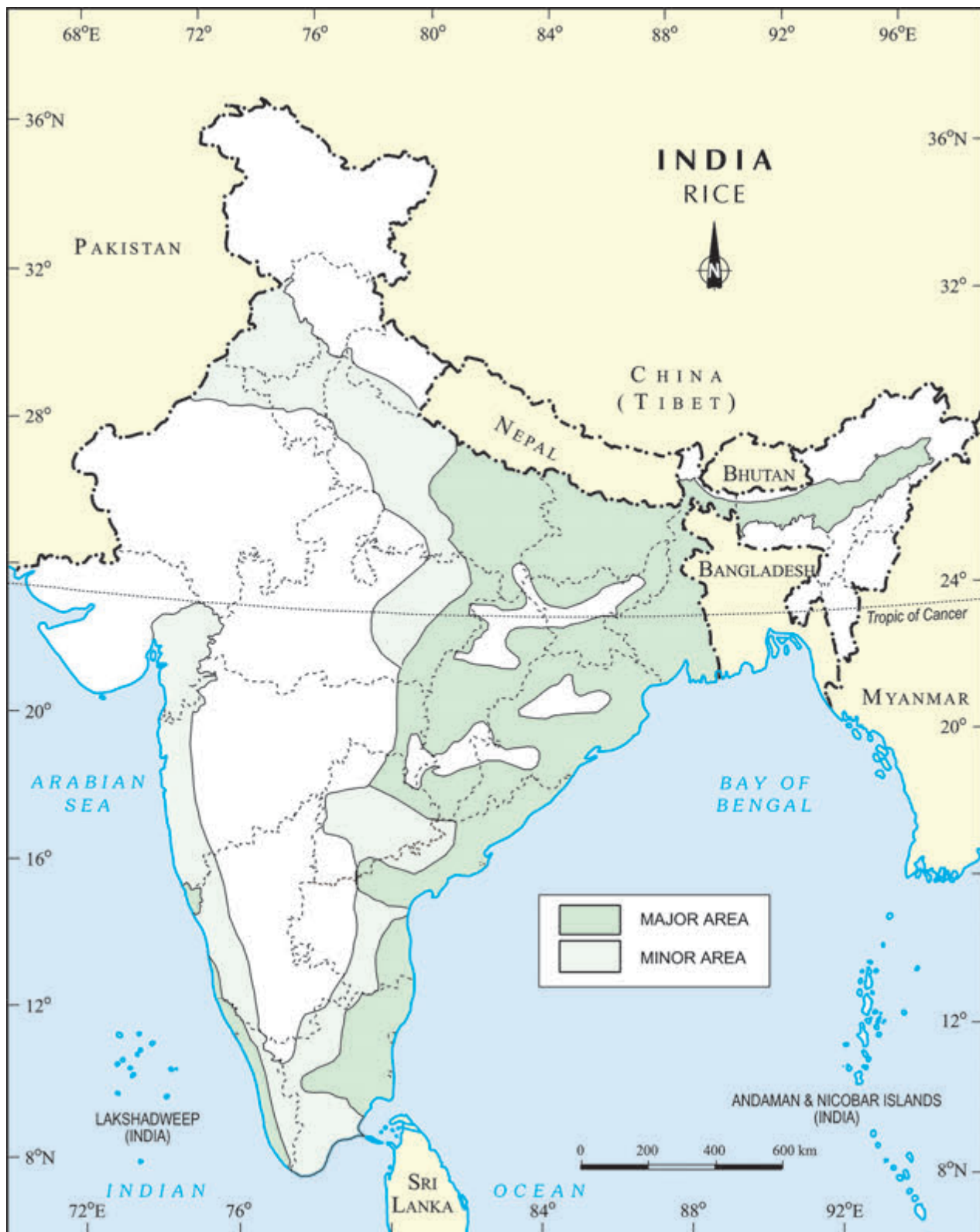
India: Distribution of Rice

Note: The map shall be updated as soon as issued by survey of India.