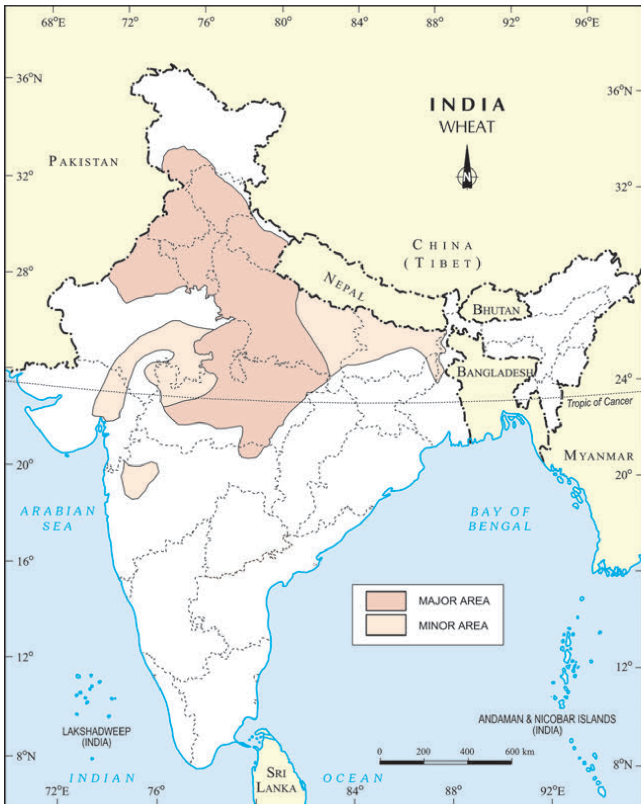
India: Distribution of Wheat

Note: The map shall be updated as soon as issued by survey of India.