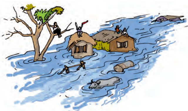
Fig. 14.11 A scene of a flooded area

rains may lead to rise in the level of water in rivers, lakes and ponds. The water may then spread over large areas causing floods. The crop fields, forests, villages, and cities may get submerged by water (Fig. 14.11). In our country, floods cause extensive damage to crops, domestic animals, property and human life.