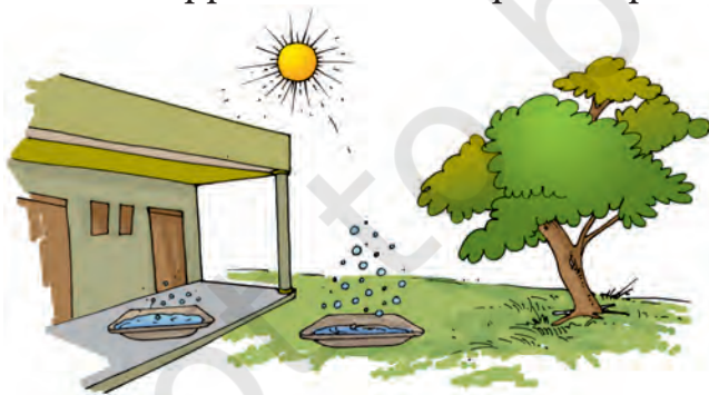
Fig.14.5 Evaporation of water in sunlight and in shade

You have learnt in Chapter 7 that plants need water to grow. Plants use a part of this water to prepare their food and