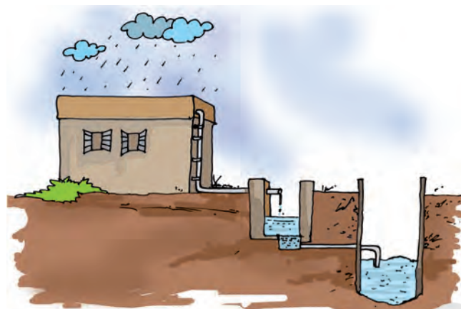
Fig. 14.13 Rooftop rainwater harvesting

the rooftop to a storage tank, through pipes. This water may contain soil from the roof and need filtering before it is used. Instead of collecting rainwater in the tank, the pipes can go directly into a pit in the ground. This then seeps into the soil to recharge or refill the ground water (Fig. 14.13).