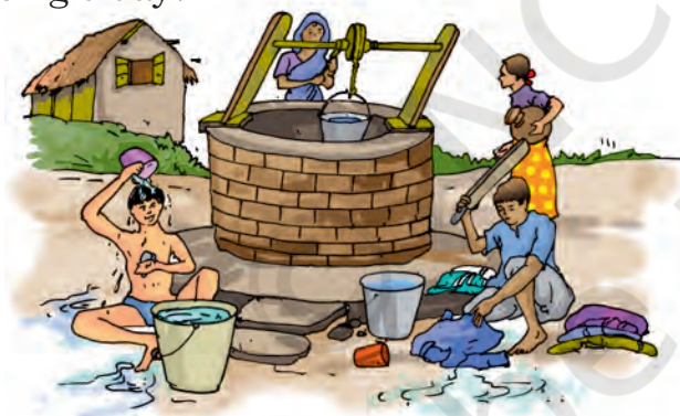
Fig. 14.1 Uses of water

Apart from drinking, there are so many activities for which we use water (Fig. 14.1). Do you have an idea about the quantity of water we use in a single day?