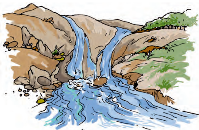
Fig. 14.8 Rainwater flows down in the form of streams and rivers

Snow in the mountains melts into water. This water flows down the mountains in the form of streams and rivers (Fig. 14.8). Some of the water that falls on land as rain, also flows in the form of rivers and streams. Most of the rivers cover long distances on land and ultimately fall into a sea or an ocean. However, water of some rivers flows into lakes.