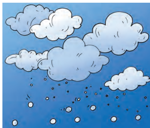
Fig. 14.7 Clouds

It so happens that many droplets of water come together to form larger sized