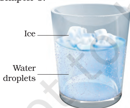
Fig. 14.6 Drops of water appear on outer surface of the glass containing water with ice

From where do water drops appear on the outer side of the glass? The cold surface of the glass containing iced water, cools the air around it, and the water vapour of the air condenses on the surface of the glass. We noticed this process of condensation in Activity 7 in Chapter 5.