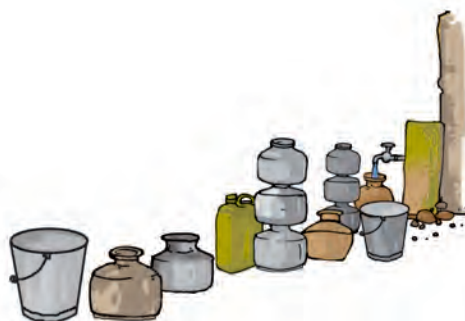
Fig. 14.12 A queue for collecting water

The demand for water is increasing day-by-day. The number of people using water is increasing with rising population. In many cities, long queues for collection of water are a common site (Fig. 14.12). Also, more and more water is being used for producing food and by the industries. These factors are leading