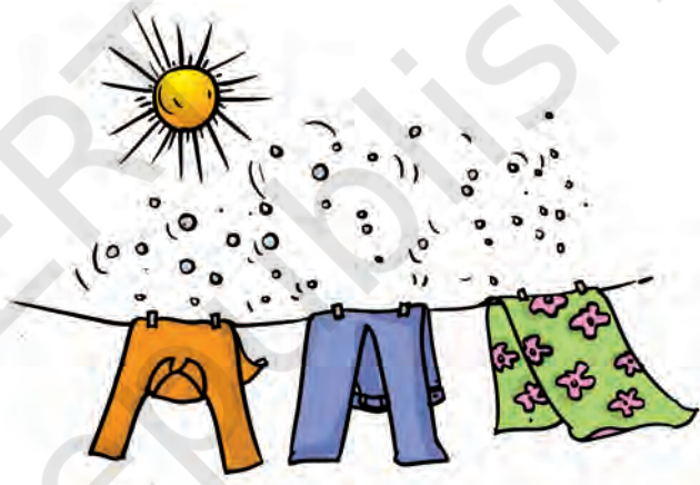
Fig. 14.4 Clothes drying on a clothes-line

How many times have you noticed that water spilled on a floor dries up after some time? The water seems to disappear. Similarly, water disappears from wet clothes as they dry up (Fig. 14.4). Water from wet roads, rooftops and a few other places also disappears after the rains. Where does this water go?