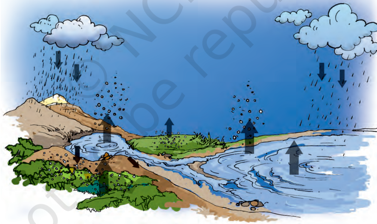
Fig. 14.9 Water cycle

However, excess of rainfall may lead to many problems (Fig. 14.10). Heavy