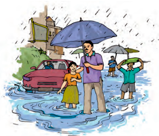
Fig. 14.10 A scene after heavy rains

The time, duration and the amount of rainfall varies from place to place. In some parts of the world it rains throughout the year while there are places where it rains only for a few days.