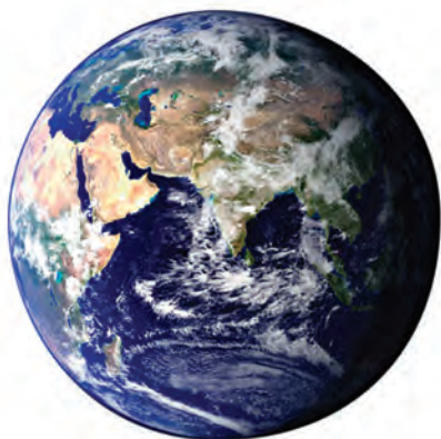
Fig. 14.3 Oceans cover a major part of the earth

Do you know that about two thirds of the Earth is covered with water? Most of this water is in oceans and seas (Fig. 14.3).