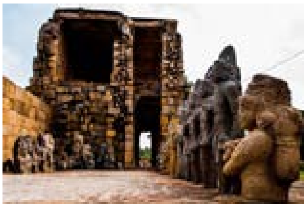
Ruins of Gangaikonda Cholapuram

Rajendra Chola's three successors were not capable rulers. The third successor Veerarajendra's son Athirajendra was killed in civil unrest. With his death ended the Vijayalaya line of Chola rule.