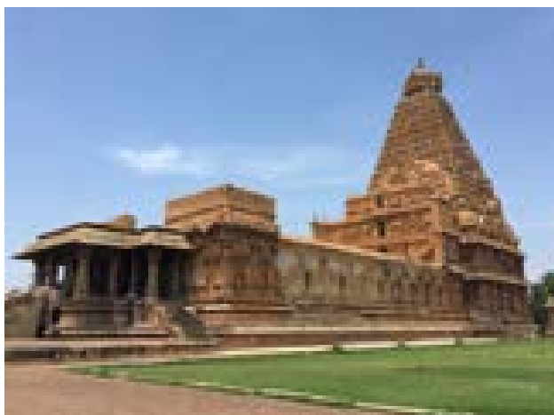
Big Temple Thanjavur

The Chola period witnessed an extensive construction of temples. The temples in Thanjavur, Gangaikonda Cholapuram and Darasuram are the repository of architecture, sculpture, paintings and iconography of the Chola art. Temples during the Chola period were not merely places of worship. They were the largest landholders. Temples promoted education, and devotional forms of art such as dance, music and drama. The staff of the temples included temple officials, dancing girls, musicians, singers, players of musical instruments and the priests.