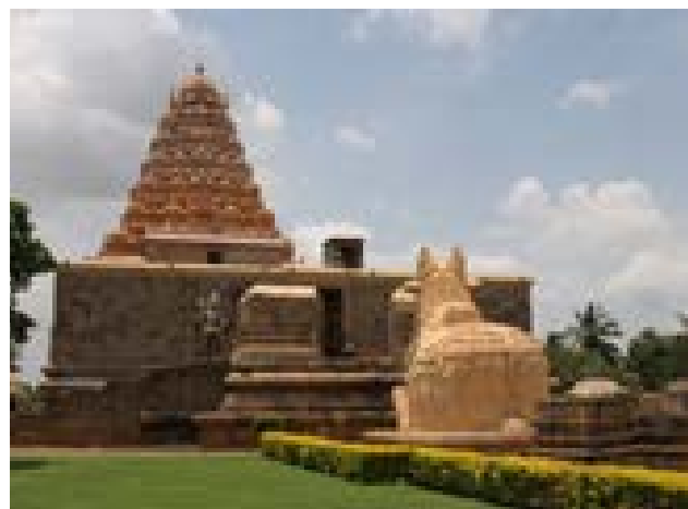
Gangaikonda Cholapuram Temple

There was a flourishing trade during the Chola period. Trade was carried out by two guild-like groups: anju-vannattar and mani-gramattar . Anju-vannattar comprised West Asians, Arabs, Jews, Christians and Muslims. They were maritime traders and settled on the port towns all along the West Coast. It is said that mani-gramattar were the traders engaged in inland trade. In due course, both groups merged under the banner of ai-nutruvar and disai-ayirattu-ai-nutruvar functioning through the head guild in Ayyavole, Karnataka. This ai-nutruvar guild operated the maritime trade covering South-East Asian countries.