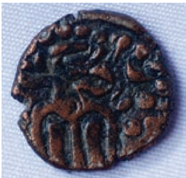
Coin of Pandya Kingdom

The illustrious ruler of the second Pandya Kingdom was Sadaiyavarman (Jatavarman) Sundarapandyan (1251 to 1268). He brought the entire Tamil Nadu under his rule, which extended up to Nellore in Andhra. He held the Hoysalas in check. The Chera ruler, the chief of Malanadu , accepted his feudatory position and paid tribute to Sundarapandyan. Emboldened by the decline of the Chola state, the Boja King of Malwa region Vira Someswara challenged Sundarapandyan. In a war at Kannanur, Sundarapandyan defeated Someswara. Sundarapandyan succeeded in establishing his authority over the chieftains of Cuddalore, Kanchipuram in northern Tamil Nadu, Arcot and Salem in the western region.