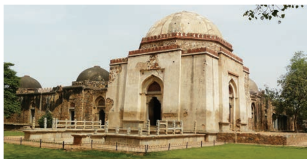
Firuz Tughlaq's Tomb

The principle of heredity permitted for the nobles and applied to the army weakened the Delhi Sultanate. The nobility that had regained power got involved in political intrigues which undermined the stability of the Sultanate. Within six years of Firuz Tughlaq's death four rulers succeeded him.