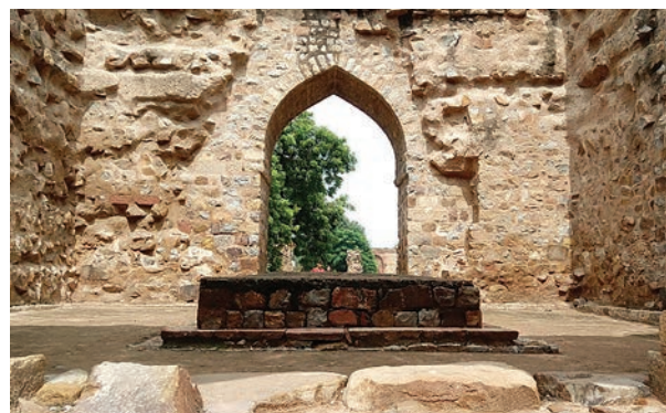
Ala-ud-din's Tomb (New Delhi)

Ala-ud-din nominated his eldest son Khizr Khan, as his successor. However, Ala-ud-din's confidant at that time was Malik Kafur. So Malik Kafur himself assumed the authority of the government. But Kafur's rule lasted only thirty-five days as he was assassinated by hostile nobles. Thereafter there were a series of murders which culminated in Ghazi Malik, a veteran of several campaigns against the Mongols, ascending the throne of Delhi in 1320 as Ghiyas-ud-din Tughlaq. He murdered the incumbent Khalji ruler Khusrau and thereby prevented anyone from Khalji dynasty claiming the throne. Thus began the rule of the Tughlaq Dynasty, which lasted until 1414.