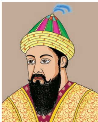
Ibrahim Lodi (modern representation)

The Lodi Dynasty was established by Bahlul Lodi (1451–1489) whose reign witnessed the conquest of Sharqi Kingdom (Bengal). It was his son Sikander Lodi (1489–1517) who shifted the capital from Delhi to Agra in 1504. The last Lodi ruler Ibrahim Lodi was defeated by Babur in the First Battle of Panipat (1526), which resulted in the establishment of Mughal Dynasty.