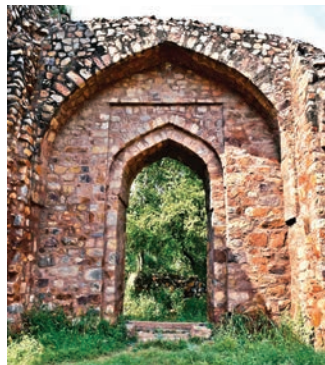
Balban's Tomb (New Delhi)

Balban succeeded in obtaining from him the assurance that Mongols would not advance beyond Satluj. Halagu Khan reciprocated this gesture by sending a goodwill mission to Delhi in 1259.