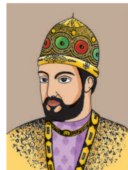
Ala-ud-din Khalji (modern representation)

Ala-ud-din spent the first year of his rule in eliminating the enemies and strengthening his position in Delhi. Soon he turned his attention to establishing a firm hold over the nobles. He dismissed several of his top officers. He was particularly severe with the nobles who had shifted loyalty and opportunistically joined him against Jalal-ud-din.