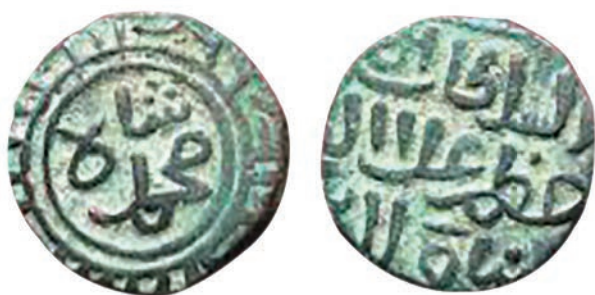
Copper coin of Ala-ud-din Khalji

gift, or as a religious endowment be brought back under the royal authority and control. He curbed the powers of the traditional village officers by depriving them of their traditional privileges. Corrupt royal officials were dealt with sternly. The Sultan prohibited liquor and banned the use of intoxicating drugs. Gambling was forbidden and gamblers were driven out of the city. However, the widespread violations of prohibition rules eventually forced the Sultan to relax the restrictions.