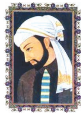
Amir Khusrau (modern representation)

Amir Khusrau emerged as a major figure of Persian prose and poetry. Amir Khusrau felt elated to call himself an Indian in his Nu Siphir ('Nine Skies'). In this work, he praises India's climate, its languages – notably Sanskrit – its arts, its music, its people,