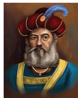
Muhammad Ghori (modern representation)

If Ghaznavid invasions were intended for loot, the Ghurids enlarged their scope to establish garrison towns to ensure the regular flow of plunder and tribute. Muizzuddin Muhammad of the