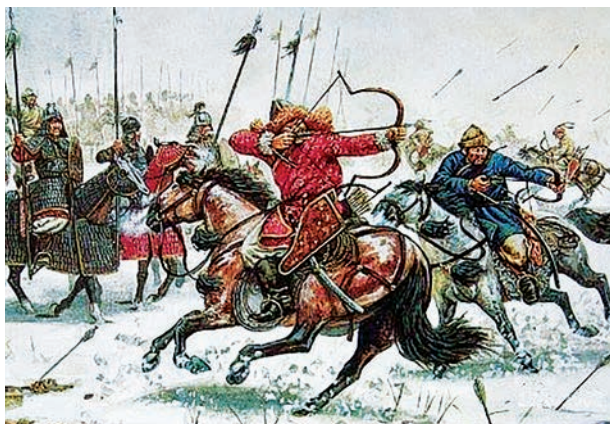
Attack of Mongols