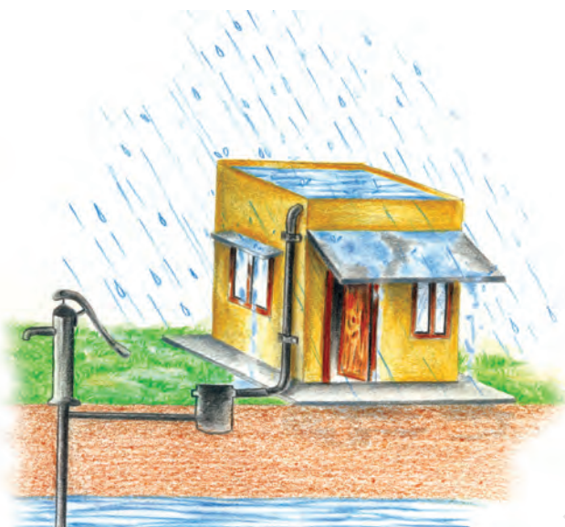
(a) Recharge through Hand Pump

irrigate their fields. In arid and semi-arid regions, agricultural fields were converted into rain fed storage structures that allowed the water to stand and moisten the soil like the 'khadins' in Jaisalmer and 'Johads' in other parts of Rajasthan.