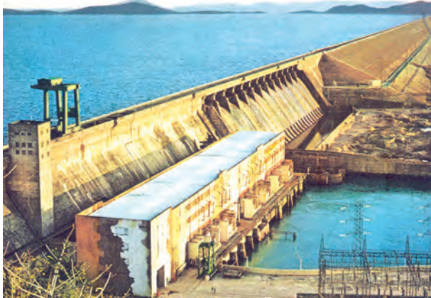
Fig. 3.2: Hirakud Dam

What are dams and how do they help us in conserving and managing water? Dams were traditionally built to impound rivers and rainwater that could be used later to irrigate agricultural fields. Today, dams are built not just for irrigation but for electricity generation, water supply for domestic and industrial uses, flood control, recreation, inland navigation and fish breeding. Hence, dams are now referred to as multi-purpose projects where the many uses of the impounded water are integrated with one another. For example, in the Sutluj-Beas river basin, the Bhakra – Nangal project water is being used both for hydel power production and irrigation. Similarly, the Hirakud project in the Mahanadi basin integrates conservation of water with flood control.