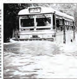
BARELY AHEAD A bus is stuck in a waterlogged street in Kolkata on Friday

Kolkata: With two days of incessant rain—and more forecast for the next three—Kolkata is in a complete state of flood. The city has so far recorded 238.4 mm rainfall. There is a lot of electricity in the southern part of the city and there is a family very killed in a wall collapse in North 24 Parganas district. Elsewhere in the state, 22 people died and nearly 70,000 houses were damaged. Bengal's water up on Friday in the district of Malda— the suspension bridges observed seven days prior to the start of Durga Puja—houses even as rain-lashed Overly South were used at Chhatrapati, Ajay, Bally, Ganga, Laxmi, Ashok, Street, Chhatra and Manikpur. People had to wade through waist-deep water in many areas. Ganga Highway, which houses hundreds and thousands of Kolkata Police, was flooded. It had been cut off since two days, but Friday's deluge and an accompanying high tide in the Hooghly river left it completely submerged. Train services were disrupted in both Eastern and South Eastern Railway's Sealdah and Howrah divisions with tracks submerged under water in