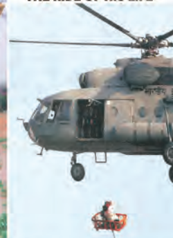
An IAF helicopter rescues a teacher who was trapped in the floodwaters of the Teer river in Jammu on Thursday