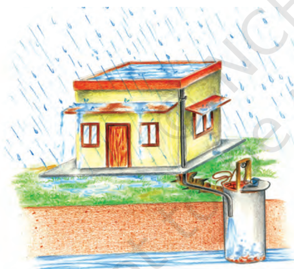
(b) Recharge through Abandoned Dugwell