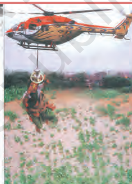
LB-07 An IAF helicopter rescues a woman and her child from the Dongargarh village of Maharashtra's Kolhapur district. In all, 11 choppers were pressed into rescue operations across the state (Related reports on P)

Collect information about flood prone areas of the country