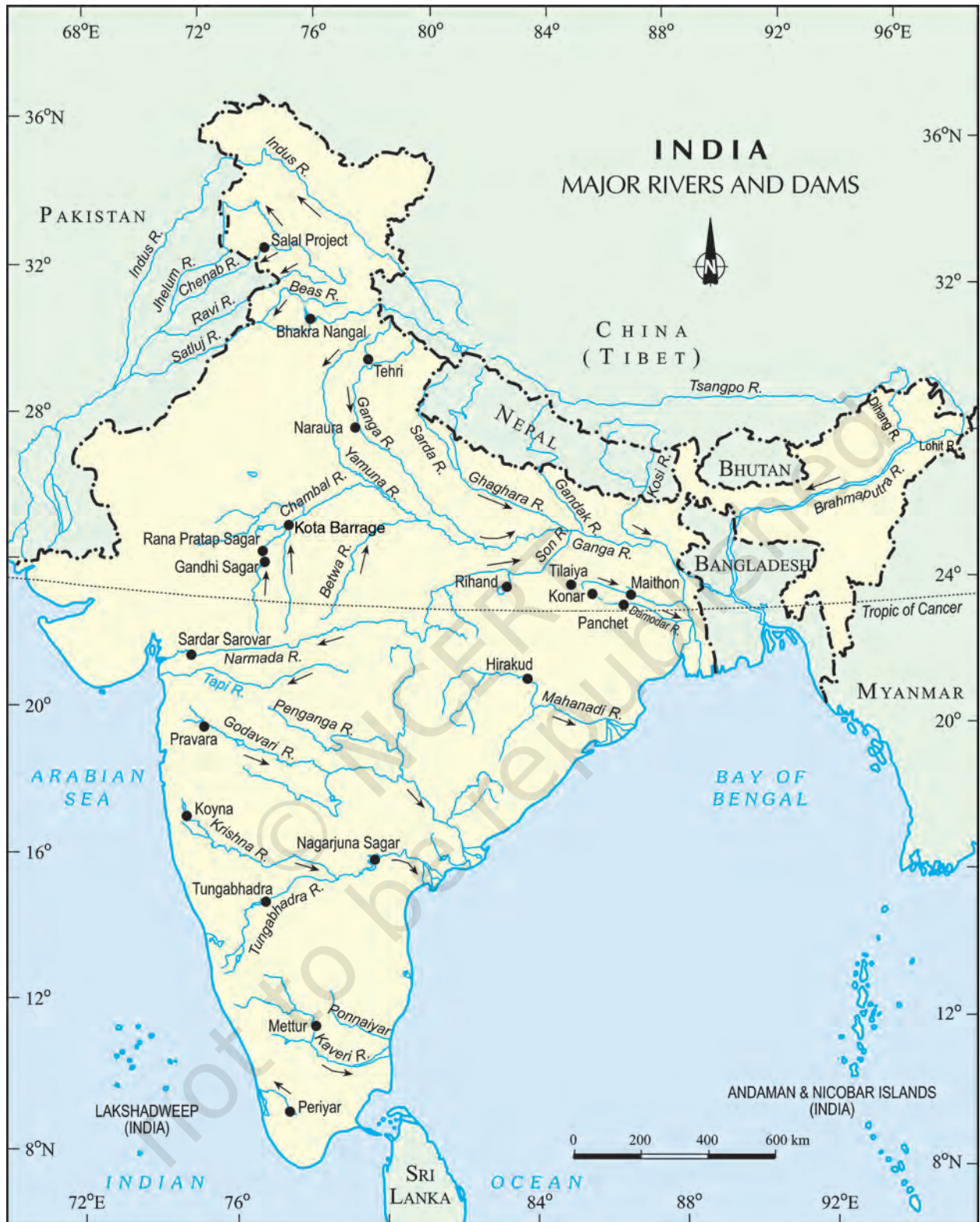
India: Major Rivers and Dams