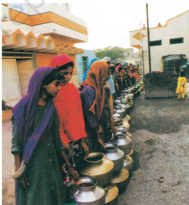
Fig. 3.1: Water Scarcity

एक ओर इजराइल जैसे 25 सेमी. औसत वार्षिक वर्षा वाले देश में जल का कोई अभाव नहीं है तो दूसरी ओर 114 सेमी. औसत वार्षिक वर्षा वाले हमारे देश में प्रति वर्ष किसी भाग में सूखा अवश्य पड़ता है। देश में जल की उपलब्धता और उसके स्वरूप के अनुसार समुचित जलप्रबंधन न होने के कारण ही वर्षा का जल नदी-नालों में तेजी से बहकर समुद्र में चला जाता है जिससे वर्षा के बाद के लगभग नौ महीने देश के लिए पानी की कमी के होते हैं। ये ही मूल कारण हैं देश में जलीय अभाव के, जिसे हम उचित प्रबंधन के द्वारा ही नियंत्रित कर सकते हैं।