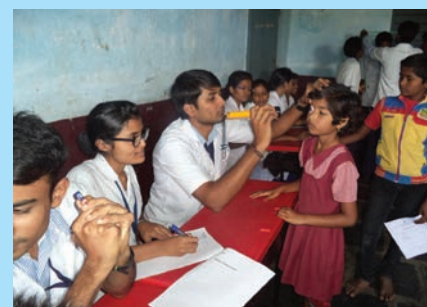
School Health Programme