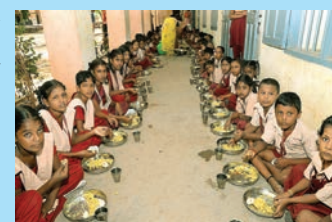
Mid-Day Meal Programme