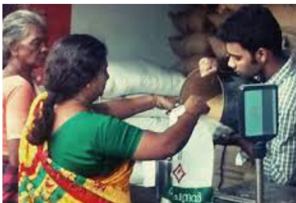
Public Distribution System

Tamil Nadu has adopted an 'Universal' PDS, the rest of the states in India had a 'Targeted' PDS. Under universal PDS all the family ration card holders are entitled to the supplies from PDS. In the targeted PDS, the beneficiaries are identified based on certain criteria and given their entitlements, leaving out the rest. Both the Union and the State governments subsidised the supplies distributed through PDS. The level and quantum of subsidy also varied across states.