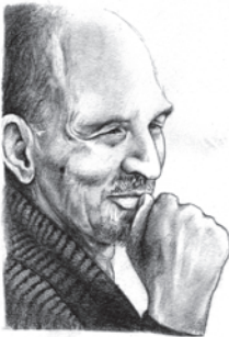
Ingmar Bergman 1918-2007

Ingmar Bergman is a well known Swedish director of films noted for their starkness, their subtle use of black and white and 'shades' of those extremes, the ambiguity of their content, and a certain brooding presence that seems to pervade them all. The list of Bergman films is long; his best known include The Seventh Seal (1957), Wild Strawberries (1958), The Virgin Spring (1960), The Silence (1963), Persona (1967), The Passion of Anna (1970), and Cries and Whispers (1973)—this last film in colour, though emphasising red in all its shadings. In the following selection, the Introduction to Four Screen-plays by Ingmar Bergman (1960), Bergman discusses how he views the art of film-making.