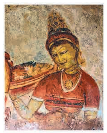
Mural of Sigiriya

There is an enormous rock in the mountains near the city of Dambulla. A fort and a palace was built on this rock. At its entrance a huge image of a lion was carved in the rock. The place was named 'Sigiriya' after this lion. Sigiriya murals are compared with the murals at Ajanta.