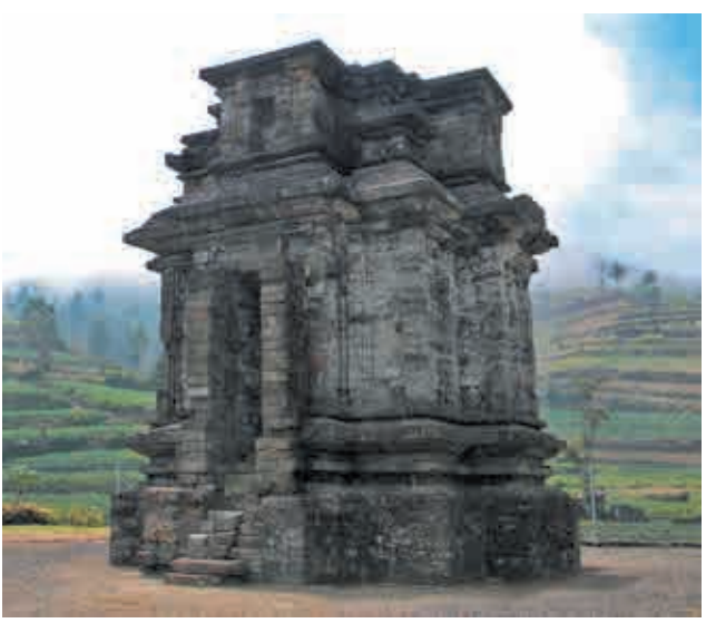
Dvaravati style of temple architecture

The ancient Thai people Thailand: referred to their country as 'Mueng Thai'. However, it was known in the world as 'Siam'. In the 20th century its name was changed to 'Thailand'. Thailand was ruled from the 6th to the 11th century by 'Mon' people. At that time it was known as 'Dvaravati'. Indian culture was introduced and spread in Thailand in the 'Dvaravati' period. The Indian traditions of sculpture, literature, ethics, judicial science, etc. had a great role in shaping up the Mon culture. Compared to other kingdoms in Southeast Asia the kingdom of Dvaravati was smaller and weaker. However, it contributed greatly development the of writing, administration, religion and science, etc. in the other kingdoms. The remains of sculptures and architecture of the Dvaravati period have been found in the vicinity of the cities like Lop Buri (Lao Puri) and Ayuttha (Ayodhya).