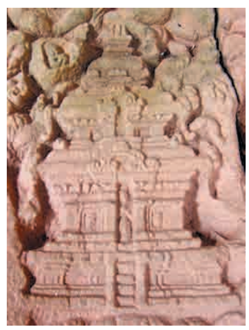
Sculptural model of My Son Temple

The characteristic aspect of the architectural style of My Son temples is that it is imagined in the form of 'Meru Parvata'.