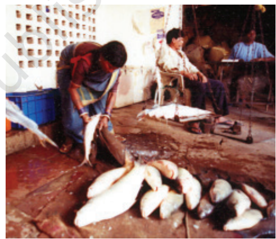
Top: Members of the TMS protesting at a rally. Above: A member of the cooperative weighing the fish.

With the TMS taking over the fishworkers were able to increase their earnings substantially. This was because they set up the cooperative which would buy the catch from them at a fair price. The cooperative would then arrange to transport and sell this in markets where they would get a good price. They have now begun to earn three times more than they earned earlier. The TMS has also begun giving the fishworkers loans for repair and the buying of new nets. By managing to earn a higher wage as well as preserving the fish in the reservoir, the TMS has shown that when people's organisations get their rights to livelihood, they can be good managers.